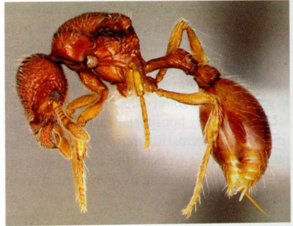
FIGURE 2. Image created using Syncroscopy Automontage software.

Renner and Ricklefs (1994) claim that systematists should not see themselves as "service providers", for this will take away from the intellectual validity of the discipline and sap it of it