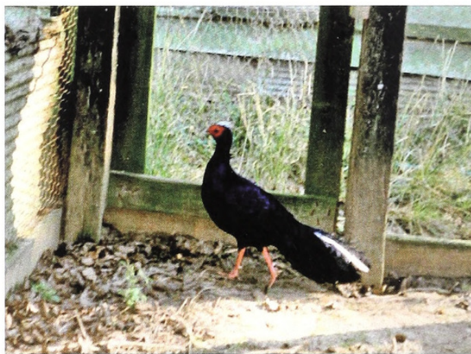
Plate 5. Male L. edwardsi born in Alabama, USA, which developed white central tail feathers in 1997. This bird phenotypically resembles L. hatinhensis . (Michel Klat)

Lophura hatinhensis is a species with a very short history. It was discovered in 1964 and described in 1975; fewer than 50 individuals have been recorded in the wild with any degree of certainty and of