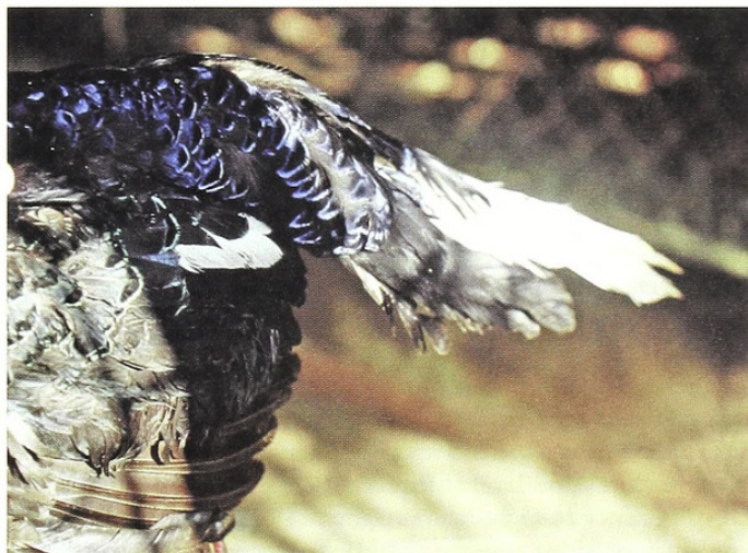
Plate 2. Dorsal view of a male L. hatinhensis caught near Hue in 1999 and subsequently retained in Hanoi Zoo that developed white tertials after its first moult in captivity. (Alain Hennache)

(Corder 1996). Towards the end of 1999 at Clères, France, a six-year-old male L. edwardsi with a history well documented in the international studbook (its parents were traced back to four different bloodlines) developed three white tail feathers on the centre-left and two on the centre-right of its tail: morphologically it had become indistinguishable from L. hatinhensis (Plate 3). In 1998 a female L. edwardsi held at a collection in Germany developed one white central tail feather when it was three years old (Plate 4). In 1997 a male L. edwardsi held at a collection in Alabama, USA, developed