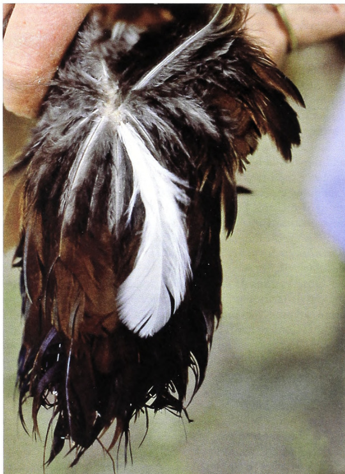
Plate 4. Tail of female L. edwardsi born in Germany 1995 (international studbook number 882) showing one white tail feather. (Alain Hennache)

white tail feathers (Plate 5). Inbreeding has led to a number of other morphological changes in the captive population of L. edwardsi : in the 1970s the crest was reduced or absent on some birds (Lovel 1979) and in 1999 birds imported from the USA were on average a third smaller than European captive birds (AH pers. obs.).