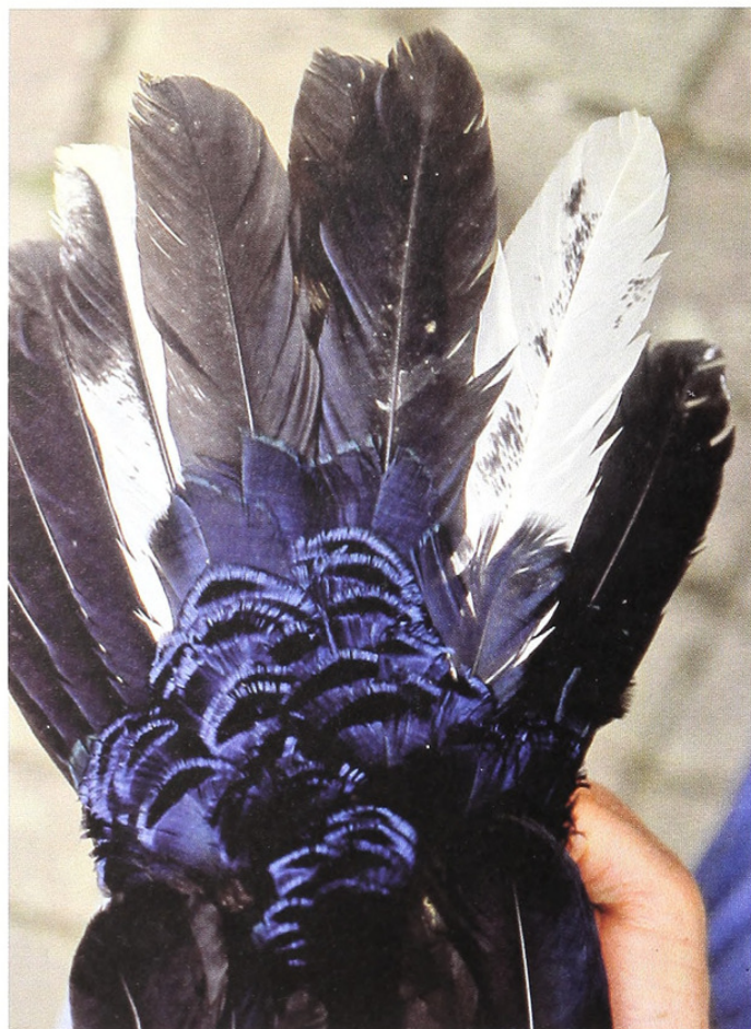
Plate 3. Tail of male L. edwardsi born in France 1993 (international studbook number 586) showing two partially white tail feathers that developed after six years. (Alain Hennache)