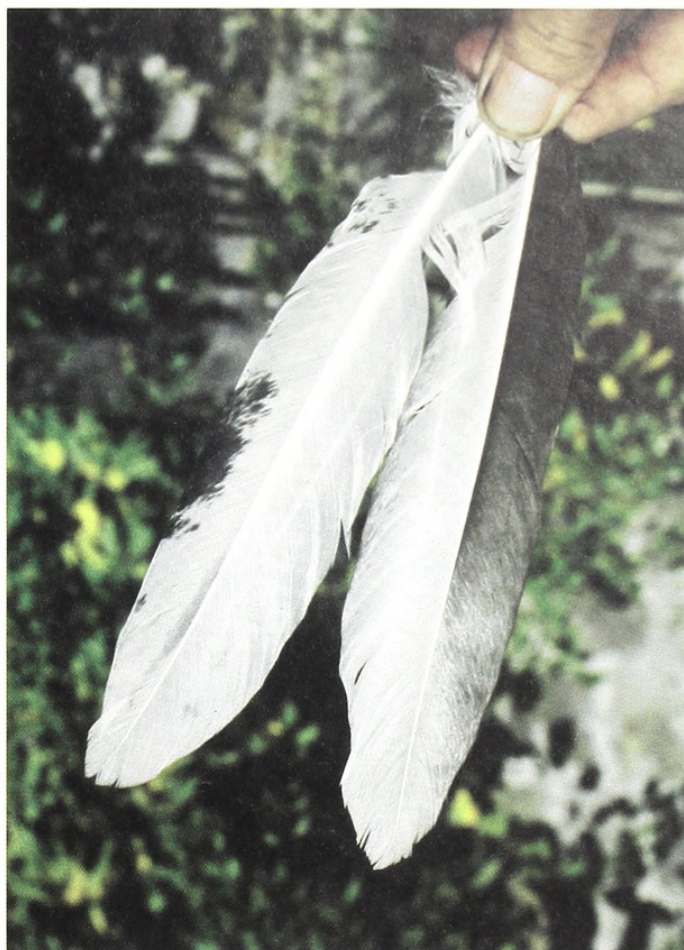
Plate 1. Tail feathers of a male L. hatinhensis which died in Cau Dien Breeding Center in 1999 showing variable pattern of white on tail feathers. (Alain Hennache)

Morphological features thought to be unique to L. hatinhensis have arisen in pure-bred captive lines of L. edwardsi and in some individuals typical L. edwardsi plumage features have been lost