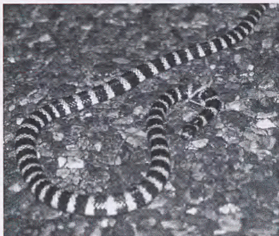
The Wide-banded Bandy-bandy Vermicella intermedia feeds exclusively on blind snakes and may thus avoid the direct consequences of Cane Toad toxicity. (Lorae McArthur)