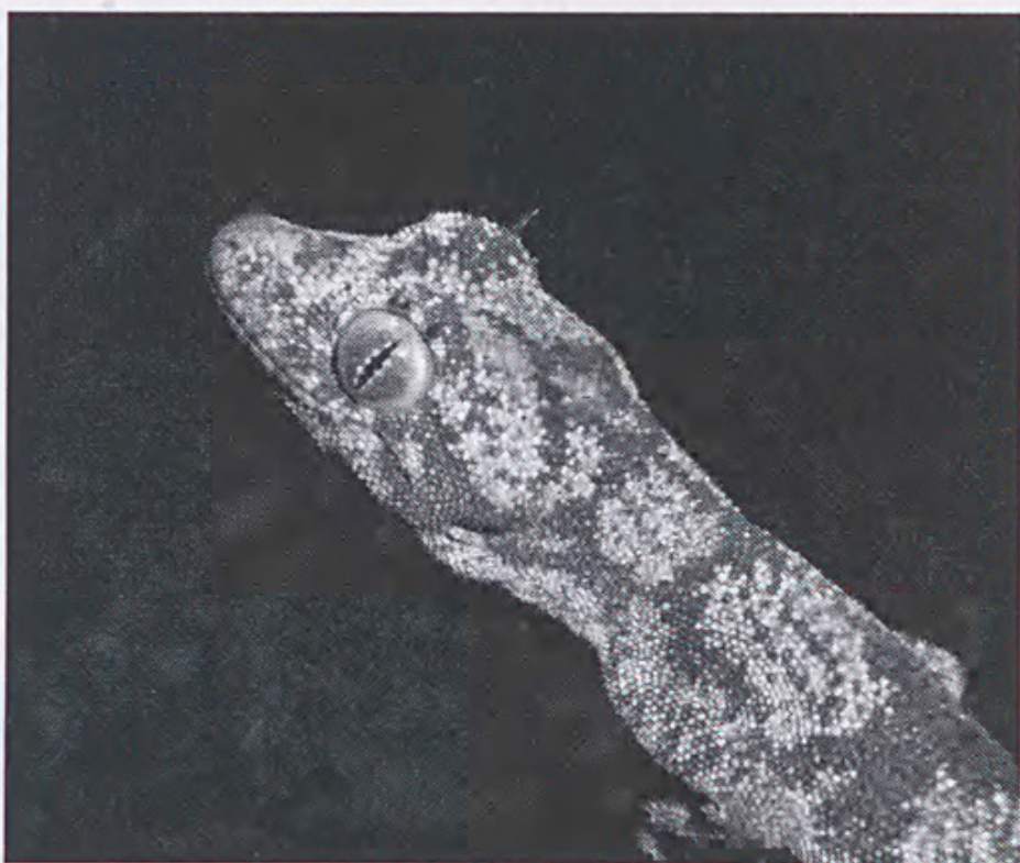
The Northern Spiny-tailed Gecko Strophurus ciliaris ciliaris was recorded near Robin Falls mostly in the dry season.