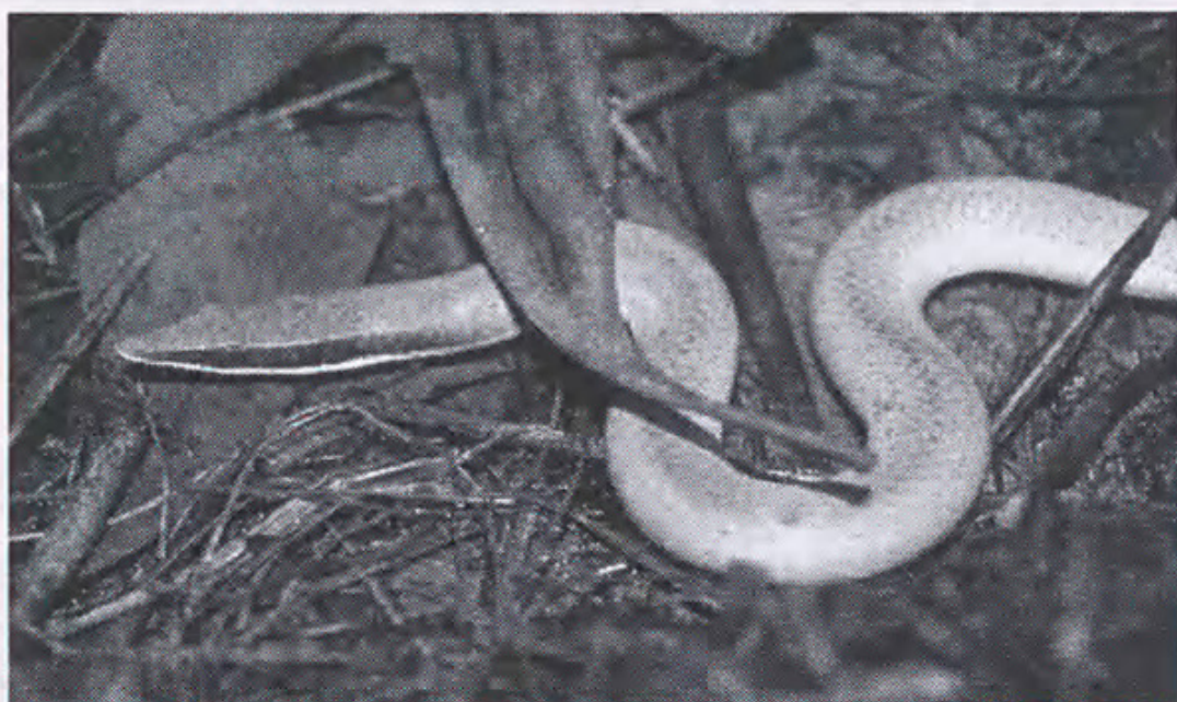
The resemblance of Burton's Snake-lizard Lialis burtonis to snakes is superficial.