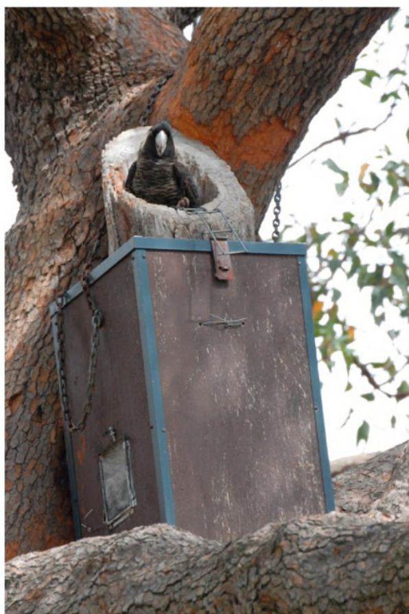
Figure 1. Nest 358 – large wooden box

A large wooden box nest 358 (Figure 1) made with exterior grade plywood and measuring 750 mm high-deep, with a sloping hardwood spout 320 mm high at back to 50 mm at front (see figure 1) giving a total depth of over 800 mm, with circular 170 mm diameter spout entrance on a hinged lid, rectangular box 400 x 300 mm. All inside walls were lined with 10 mm square heavy gauge mesh to prevent birds chewing through the sides and allows birds to climb to entrance. All outside corners are protected