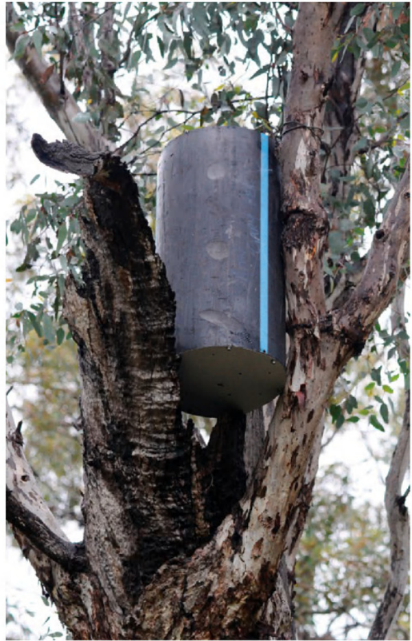
Figure 5. Nest 441 – PE pipe

unattractive to feral Honeybees and competitor species i.e. Galahs and Corellas that prefer dark hollows.