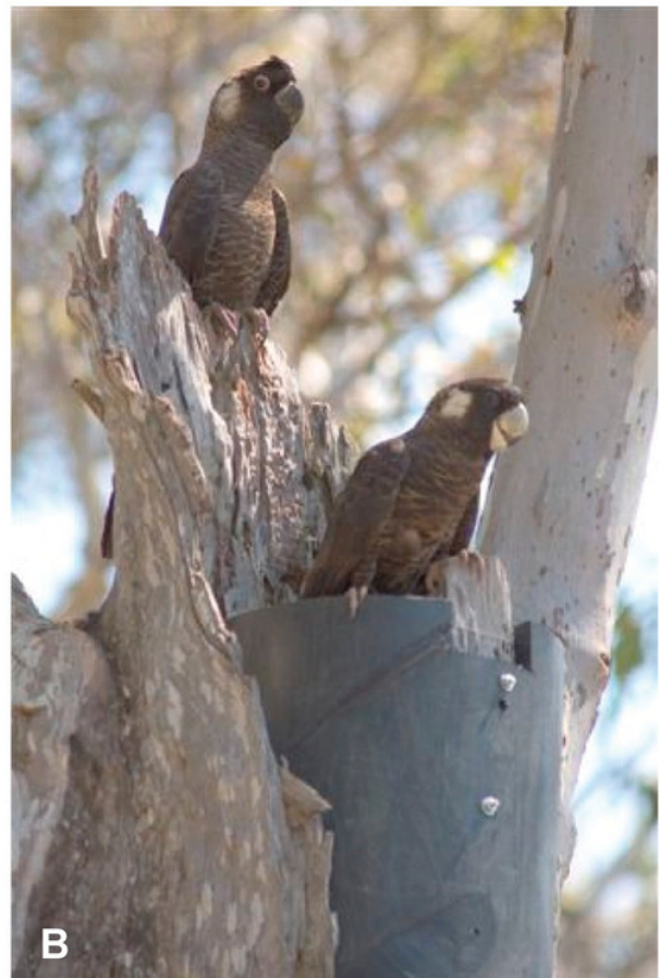
Figure 3. A: Nest 357 – PE pipe. B: Nest 357 with breeding pair.