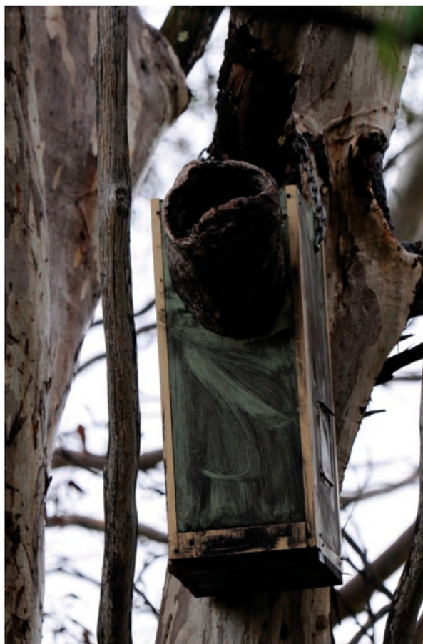
Figure 2. Nest 069 (formerly 359) – small wooden box

by 20 x 20 mm aluminium angle which prevents destruction from outside. A small observation panel is provided on one side with a galvanised plate held in position with a Tek screw. The boxes were painted with Gripset, a bitumen rubber sealant (adhesive coating, water-based, non-flammable, non-toxic, free of solvents and dangerous fumes, and UV resistant) including the inside floor to help with waterproofing.