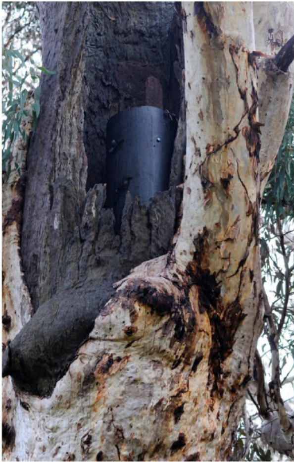
Figure 4. Nest 360 – PE pipe