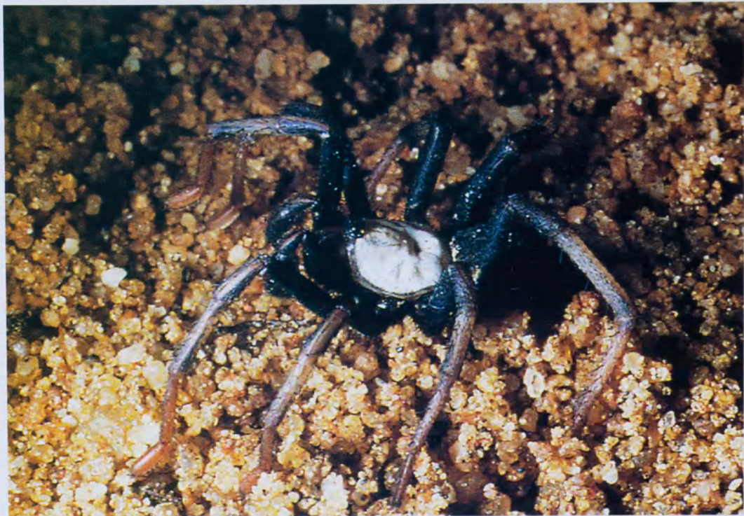
Figure 1. Arbanitis mcmillani sp nov, male (holotype) in life.

glabrous, with an enamel-like sheen, and with black, rod-like spines. Labium with a few elongate cuspules. Palpal tibia with pronounced process with many stout spines (at least 30); embolus with prong-like tip; tibia I without apophysis but with a proventral comb of three spines. Tarsi I - III without spines.