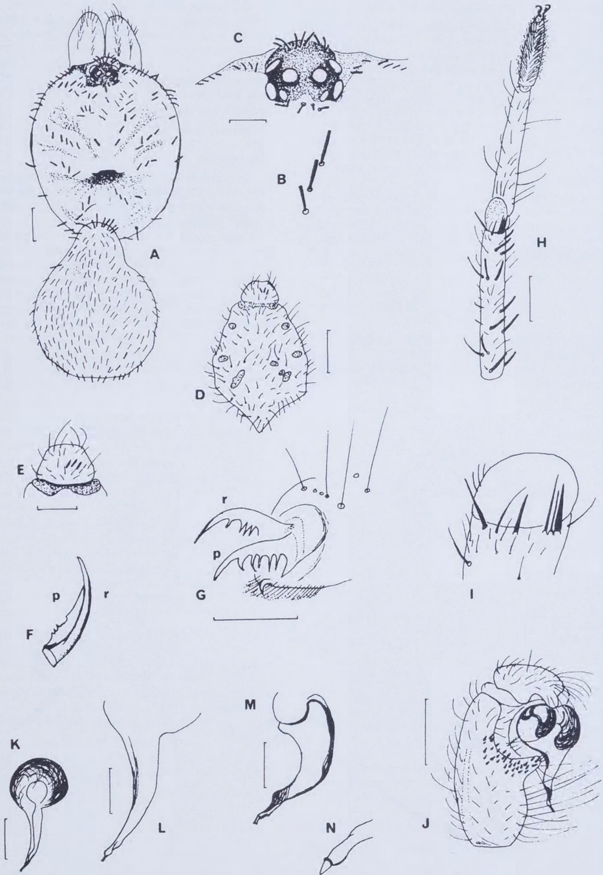
Figure 2. Arbanitis mcmillani sp nov, male (holotype). A, Dorsal view of spider, carapace and abdomen. B, Several spines of carapace enlarged. C, Eye group. D, Labium and sternum. E, Labium. F, Left fang, note keel and toothed promargin. G, Tarsal claws of right leg I, prolateral view (p, prolateral; r, retrolateral). H, Right leg I, tarsus, metatarsus and tibia ventral view. I, Apical ventral spines of right leg I showing proventral comb. J, Right palpal tarsus and tibia, retrolateral. K, L, Bulb and embolus, prolateral. M, Embolus, ventral. N, Embolus tip, ventral (enlargement of M view). Scale bars: A, D, H, J = 1.0 mm; C, E, K = 0.5 mm; L, M = 0.25 mm; B, F, I, N, not to scale.