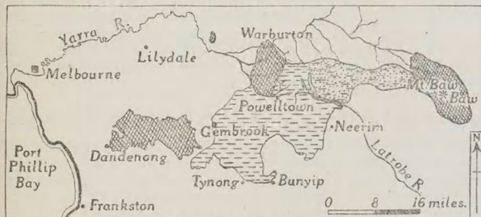
FIG. 1. Locality Map showing the Relationship of Outcrops of Granodiorite (cross hatching) to Granite (broken horizontal lines). Stippled area represents unclassified granite rocks.

The main purpose of this paper is to record the relationship between granodiorite and granite at Powelltown in the parish of Beenak, County of Evelyn, about 45 miles due east of Melbourne (fig. 1).