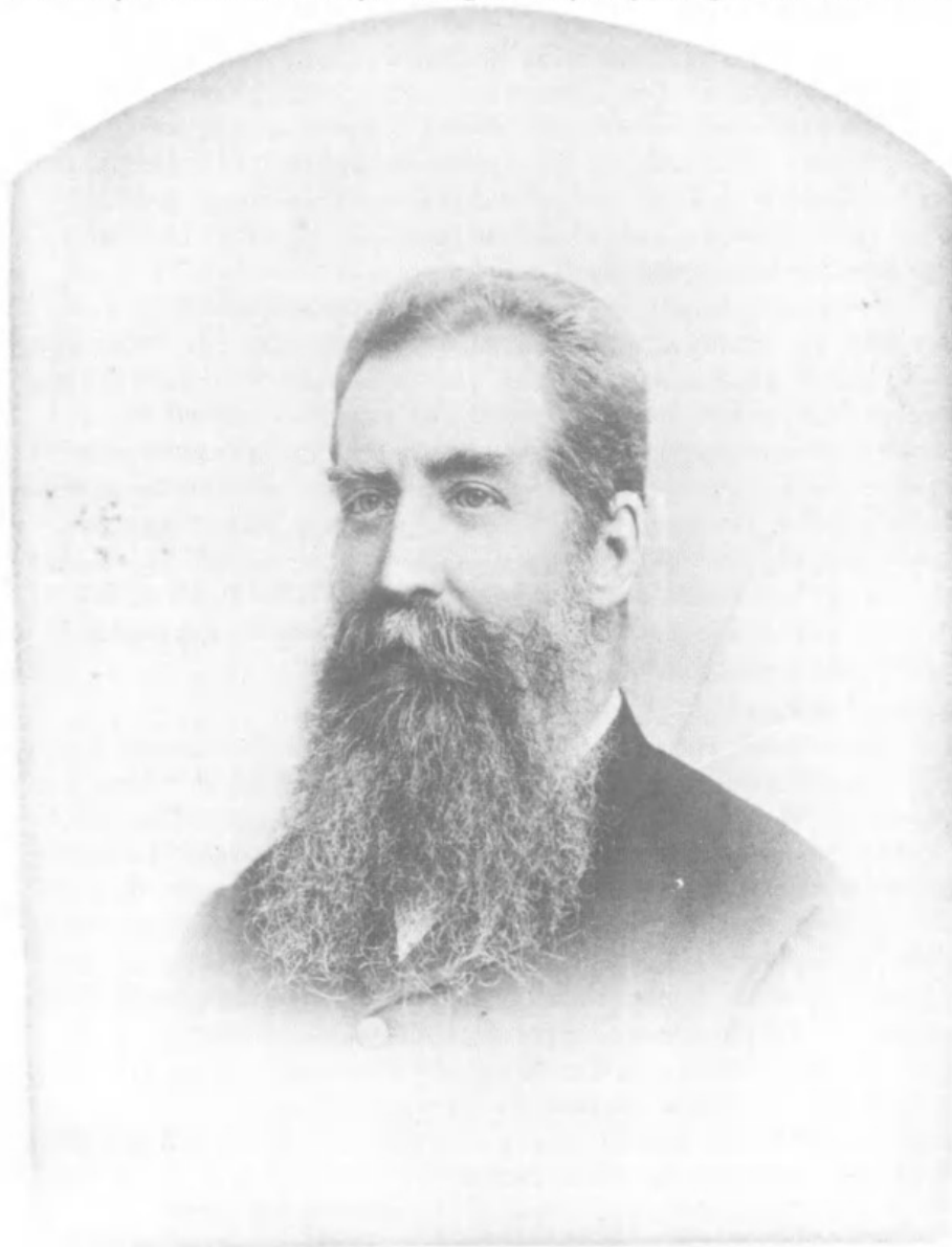
Albert Norton MLC, formerly speaker of the Legislative Assembly.