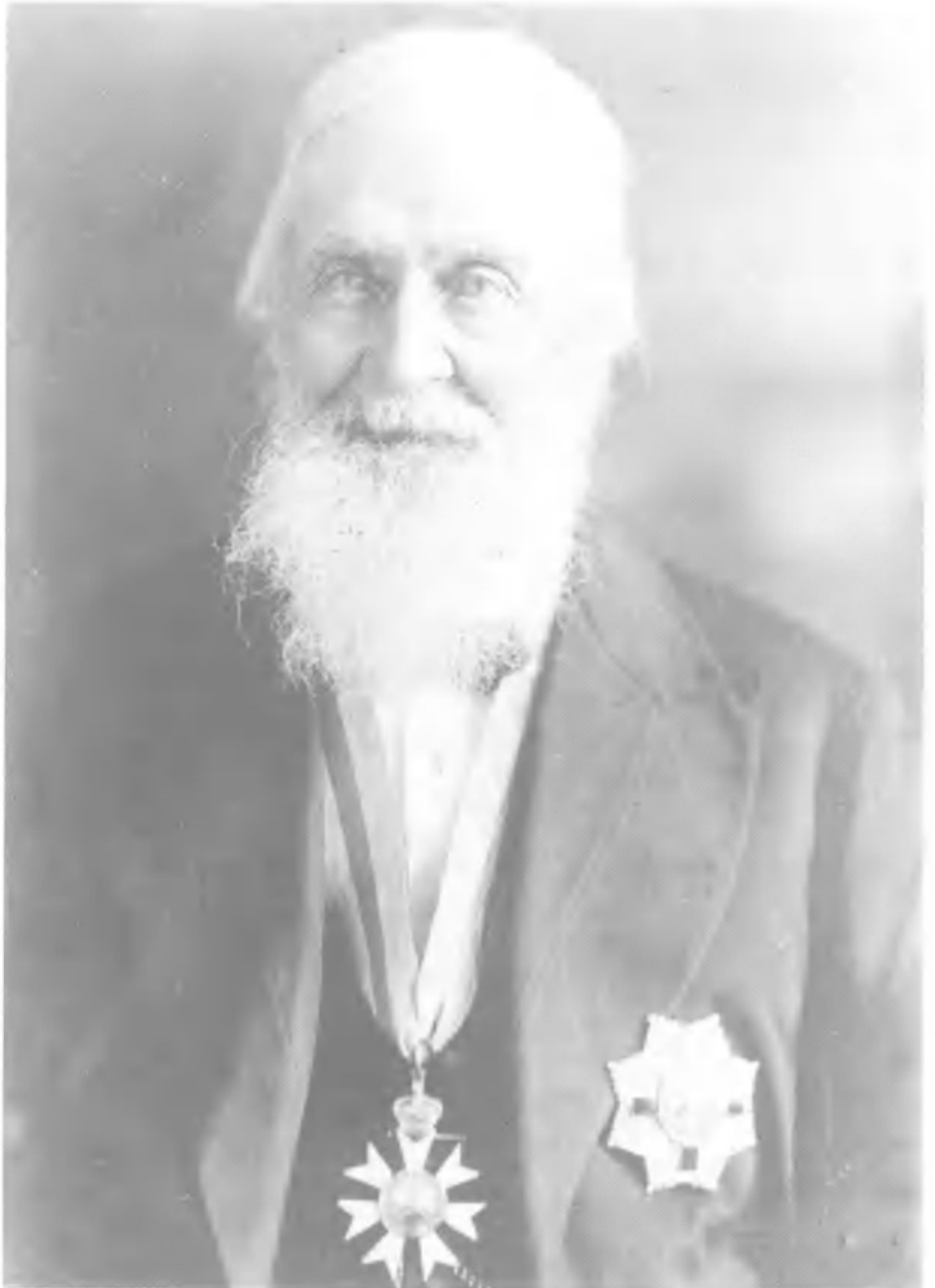
Augustus Charles Gregory KCMG, scientist, explorer and surveyor general of Queensland and the first chairman of the museum board of trustees.