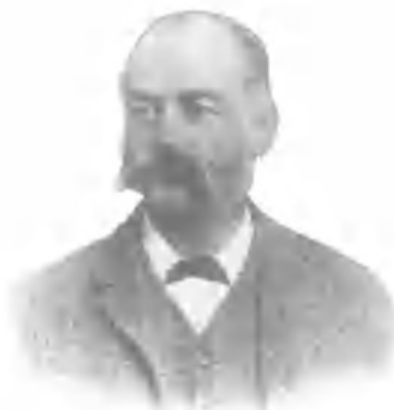
W.O. Hodgkinson MLA, explorer, journalist, public servant and politician.