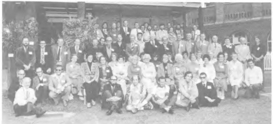
Participants in the seminar for small museums held in May 1978.