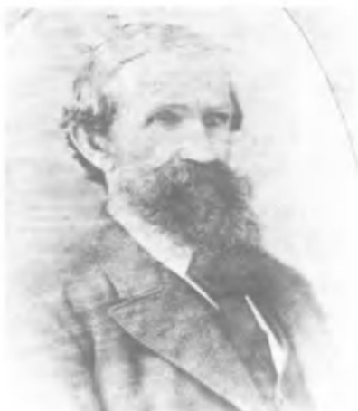
John M. Macrossan MLA, miner and politician—secretary for Mines.