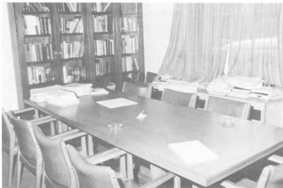
The table in the director's office where, from 1970, the Queensland Museum Board of Trustees met at 11.00am on the first Tuesday in each month.