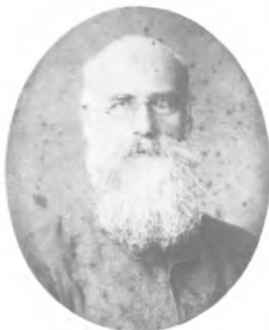
The Hon. Berkley B. Moreton MLA, secretary for Public Instruction (photograph by courtesy Oxley Library).