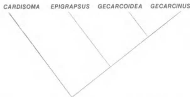
FIG. 1. Phylogenetic relationships within Gecarcinidae.

The third cladogenesis split Gecarcoidea and Gecarcinus .