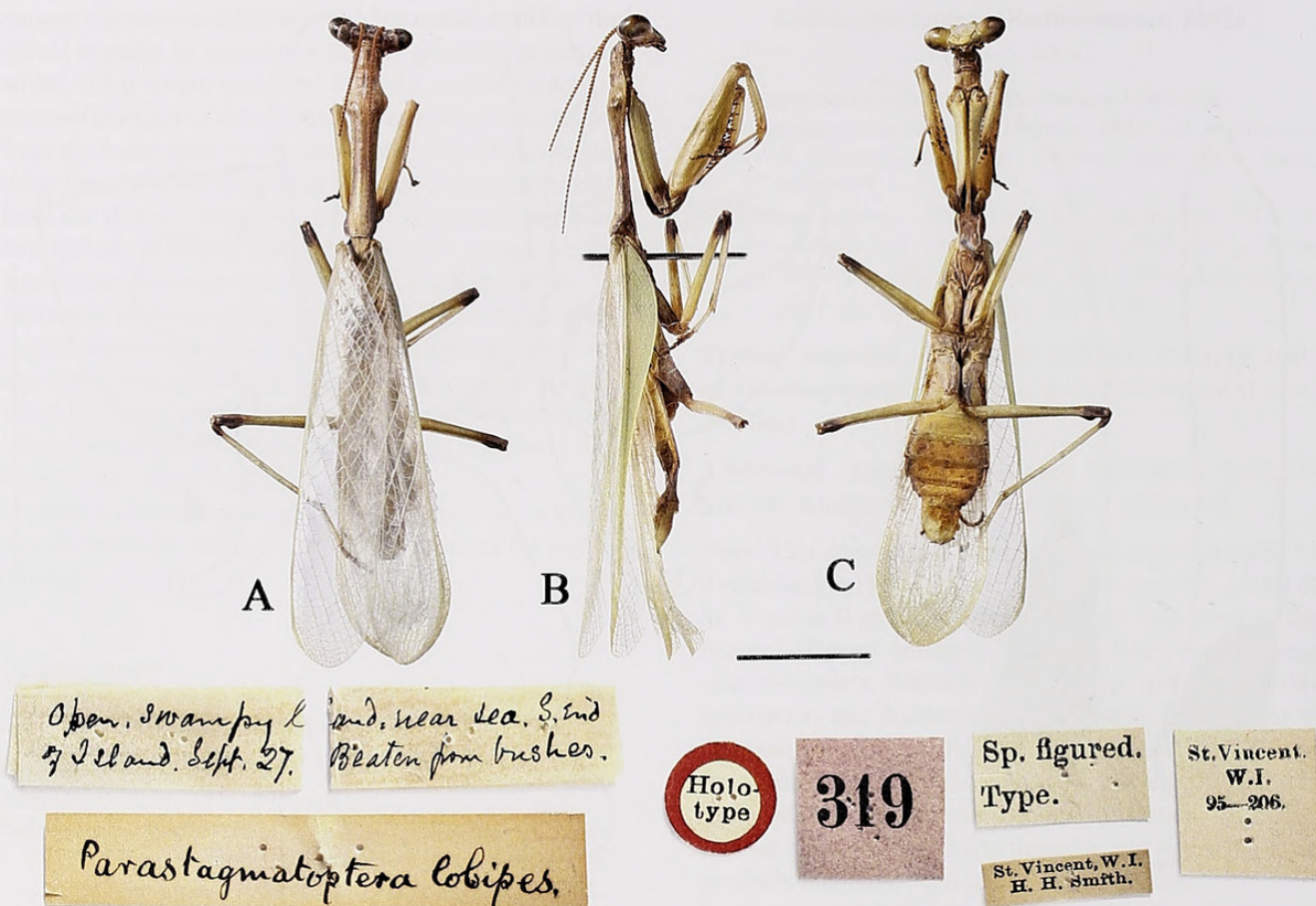
Fig. 6. Holotype of Parastagmatoptera lobipes . (A) Dorsal view. (B) Lateral view. (C) Ventral view. Scale 1 cm.

Torax: pronotum slender, about 4.31 times as long as the pronotal supracoxal dilation and 8.9 times as long as its minimum width; lateral margins with small denticles; supracoxal dilation not very developed and with lateral margins widely rounded. Disc of prozone with minute granules; disc of the metazone with an indistinct median carina extending about 1/3 of its length; ratio metazone/prozone is 2.8. Fore legs slender: coxae (Fig. 2) 0.62 times as long as the pronotum, prismatic with a triangular section; inner surface with a black band covering about 1/3 of the length of coxae; all margins with small tubercles with an apical short hair; inner distal lobes divergent. Femora 5.15 times as long as its maximum width, upper margin almost straight, all spines ochre with brown apex. Tibiae reaching half the length of the femora, all spines green with brown apex. Spination formula F=14-16IS/5ES/4DS and T=14-15IS/11ES . Middle and hind legs slender; femora smooth, tibiae and tarsi with scarcely hairs. Posterior metatarsi 1.6 times as long as all other segments together. Wings well-developed, extending well beyond the apex of the abdomen; mesothoracic wing opaque about 2.8 their maximum width, with numerous