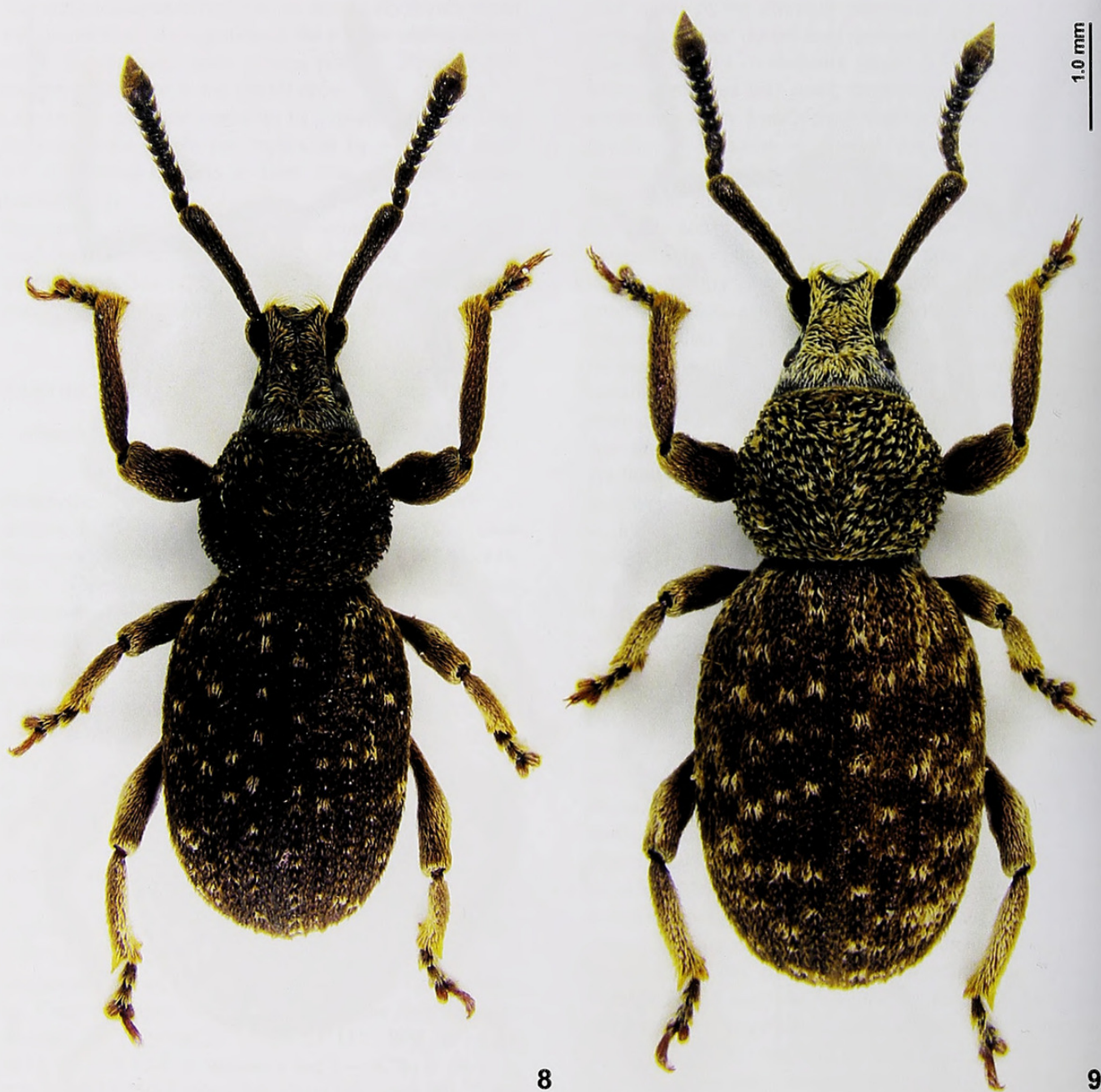
Figs 8-9. Habitus of Otiorhynchus (Choilisanus) magnicollis Stierlin, 1888 from Samos Island. (8) Male. (9) Female.

transverse, third segment much wider than second; onychium long, its projecting portion almost as long as preceding segment; middle and hind tarsi slightly longer than fore tarsi, in particular projecting part of onychium slightly longer than length of third segment.