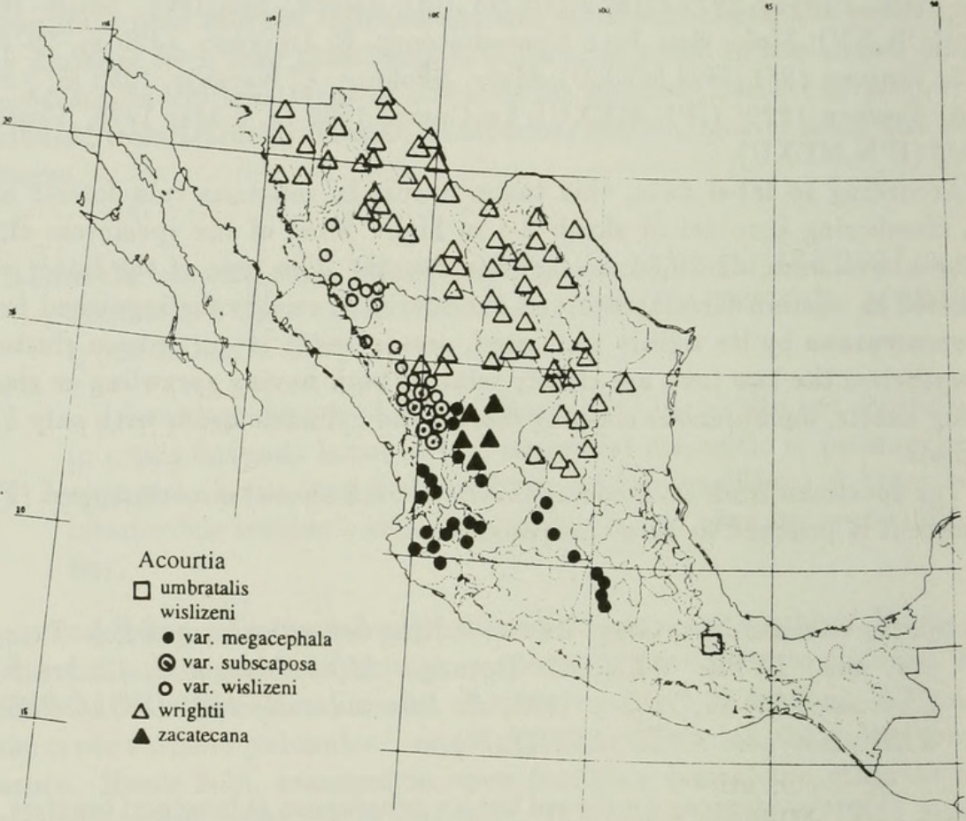
Fig. 3. Distribution of selected taxa of Acourtia in Mexico.