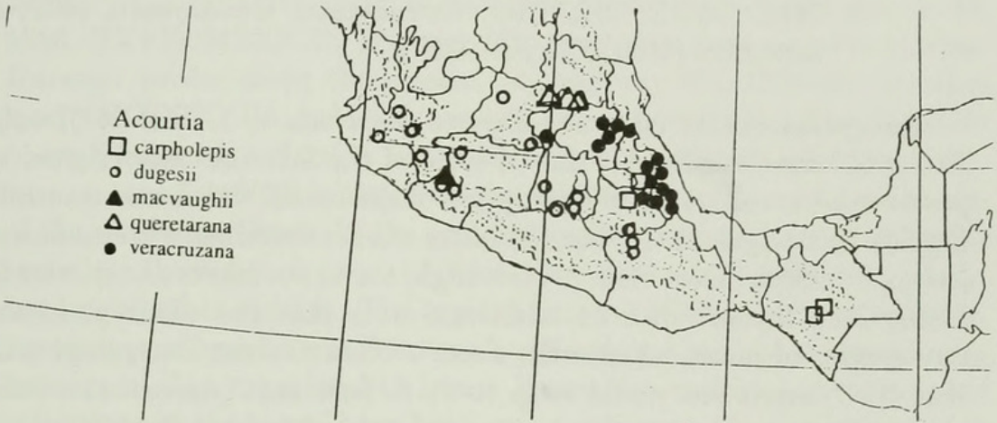
Fig. 1. Distribution of A. dugesii and closely related taxa.