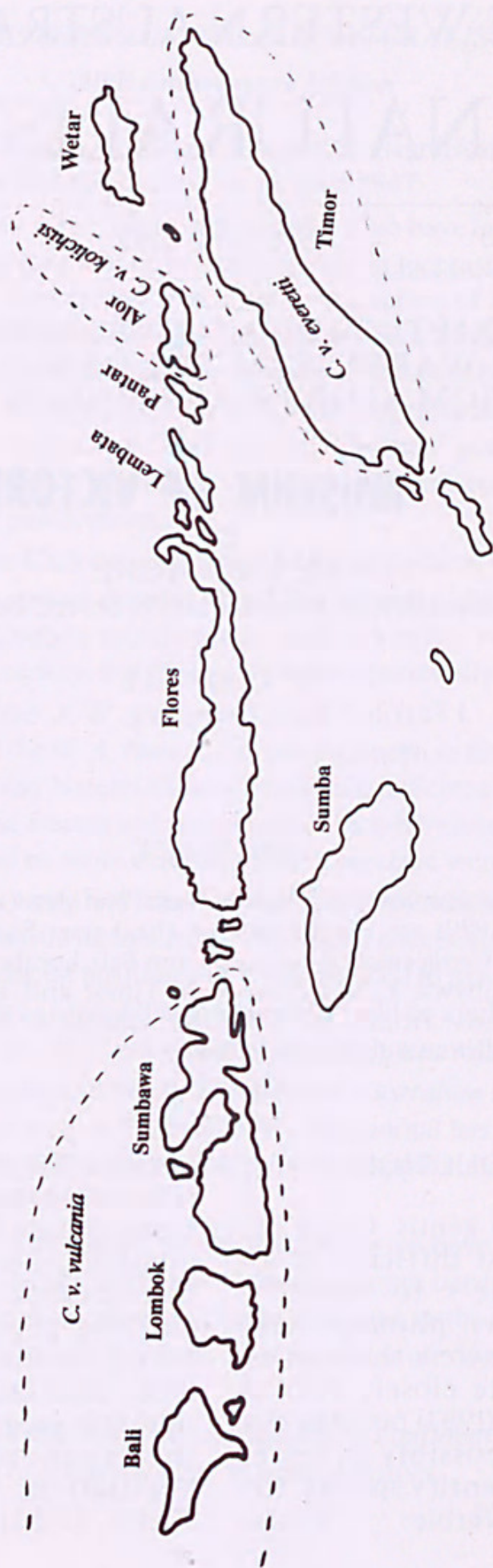
Figure 1. Map of Lesser Sunda Islands, Indonesia showing distribution of Cettia vulcania vulcania , C. v. everetti and C. v. kolichisi .