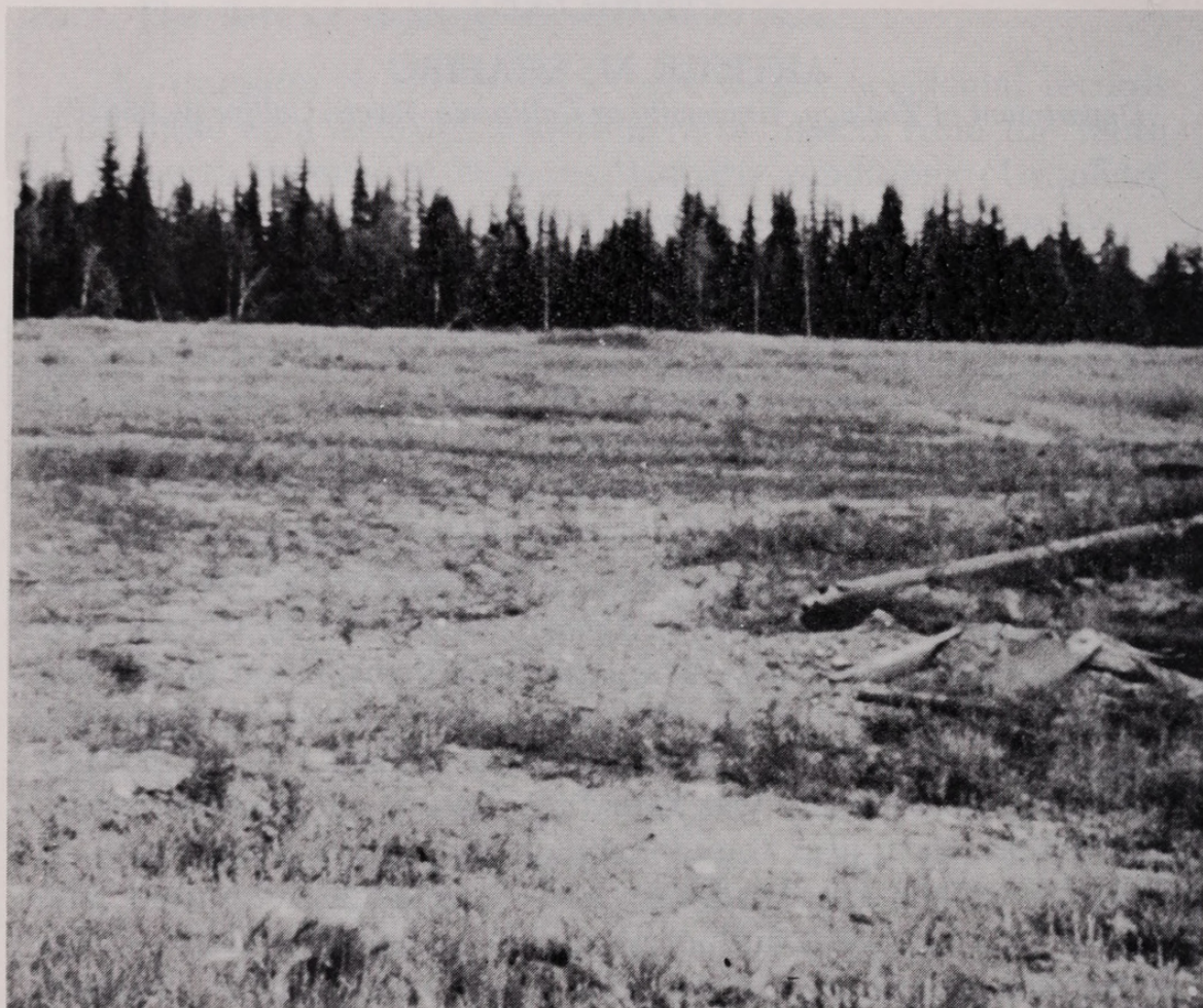
Fig. 1.—Railroad yard at Fairbanks, Alaska, looking east. Virtually the entire area from the trees at left to the road is a solid stand of Lepidium densiflorum .