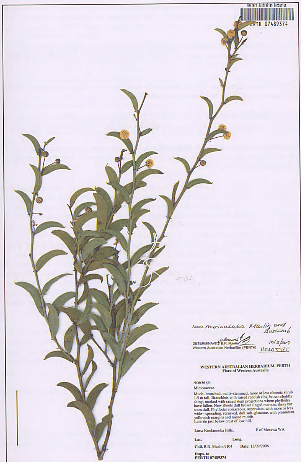
Figure 2. Holotype of Acacia muriculata (B.R. Maslin 9104), scale = 5 cm.