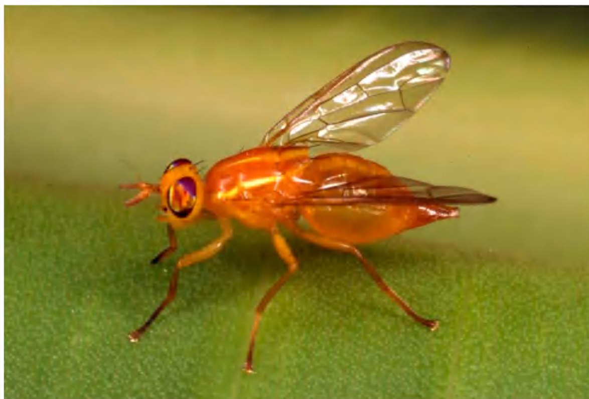
Fig. 3. Bactrocera (Notodacus) neoxanthodes female from Vanuatu.

Bactrocera (Notodacus) neoxanthodes Drew & Romig, 2001: 142. Type locality Kwero, Loh I., Vanuatu.