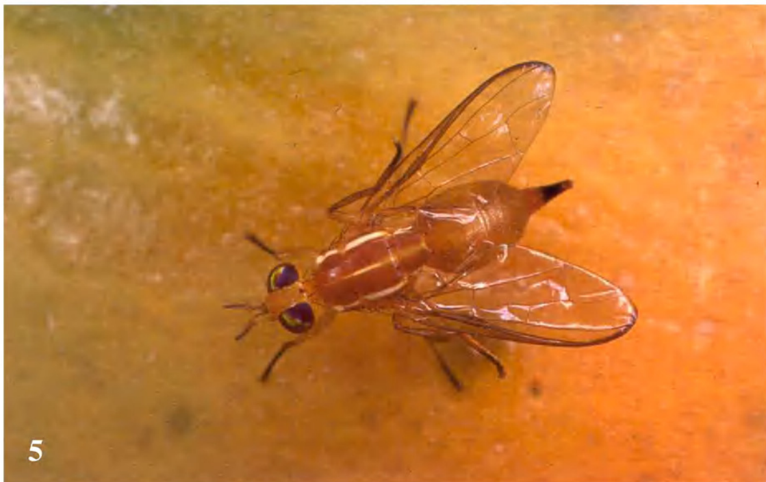
Figs 4-5. Bactrocera ( Notodacus ) xanthodes from Samoa: (4) male; (5) female.