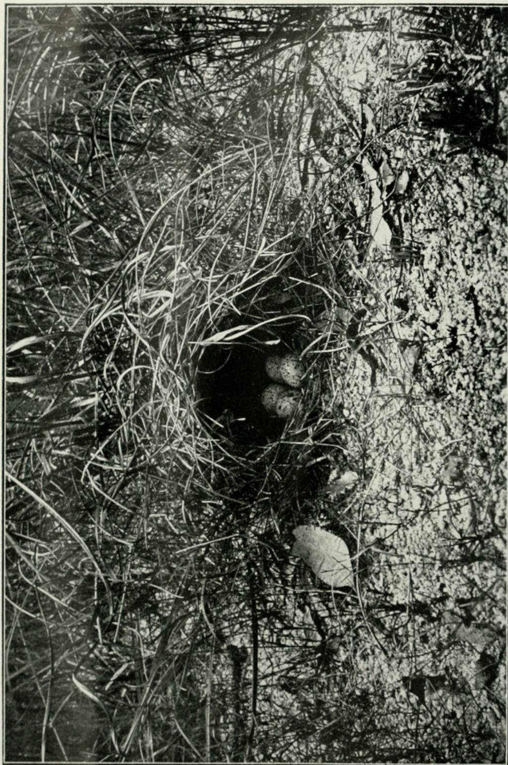
B.—Nest of Buff-breasted Quail ( Turnix olivii ) ; vegetation opened up to show eggs in nest.