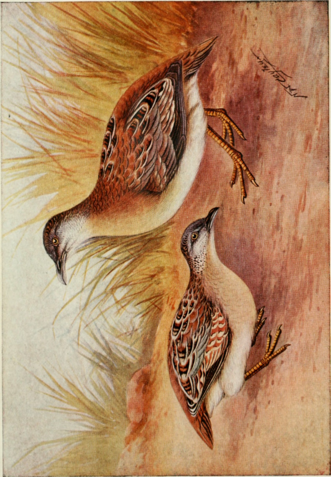
1 / 2 BUFF-BREADED QUAIL ( Turnix olivii )