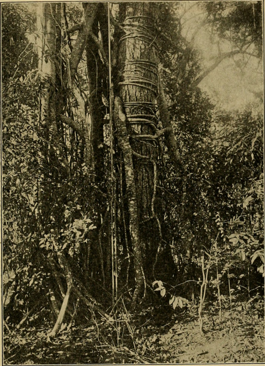
FIG. 2. The Clusia firmly established and lashed to the supporting tree.

tree. On the left-hand side of the trunk of the tree, in the first illustration accompanying this article, where a limb has been broken away, one of these plants may be seen. Not only do roots descend, but some of them throw themselves around the tree, a