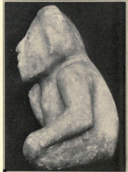
The "Perrine Image"

The carving of the features is executed with remarkable skill, and is quite modern in conception, although it is estimated the figure must have been made about 1,000 years ago, long before any Europeans set foot in America. It is similar in proportions and style to other stone figures and effigy