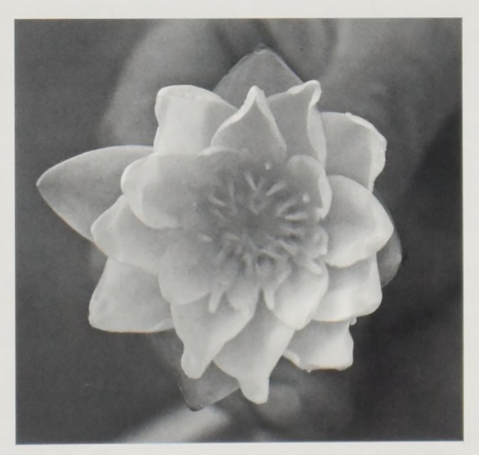
FIGURE 1. Flower of Nymphaea loriana (Lori's Water-lily).

Canada is required to "monitor, assess and report regularly on the status of all wild species" to fulfill legal obligations under the Accord for the Protection of Species at Risk (CESCC 2011). Information on the status of species is then used by organizations, such as the International Union for Conservation of Nature and the Committee on the Status of Endangered Wildlife in Canada to identify and prioritize species for legal protection and conservation work. One of the main problems involved in achieving this goal is the lack of sci-