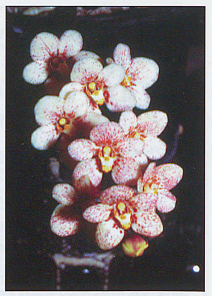
Sarcochilus First Light