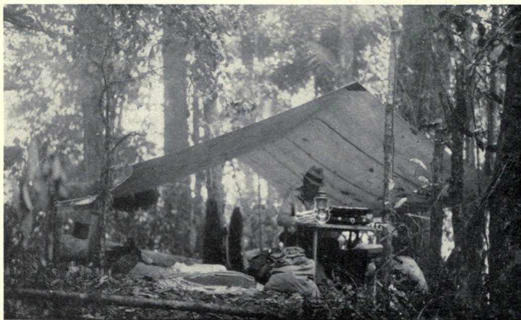
ALONE, WITH WORK, IN A CLOUD FOREST OF GUATEMALA