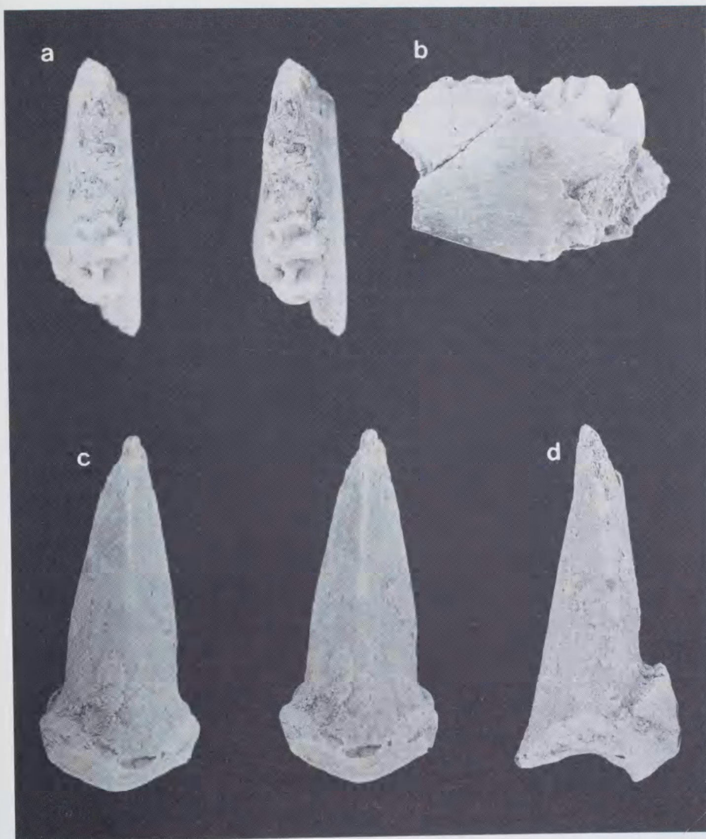
Figure 2 Stereopair of occlusal view (a) and buccal view (b) of left dentary of Macropus pan , WAM 61.7.9; and stereopair of dorsal view (c) and lateral view (d) of ungual of fourth toe assigned to M. pan , WAM 68.10.84; x 1.