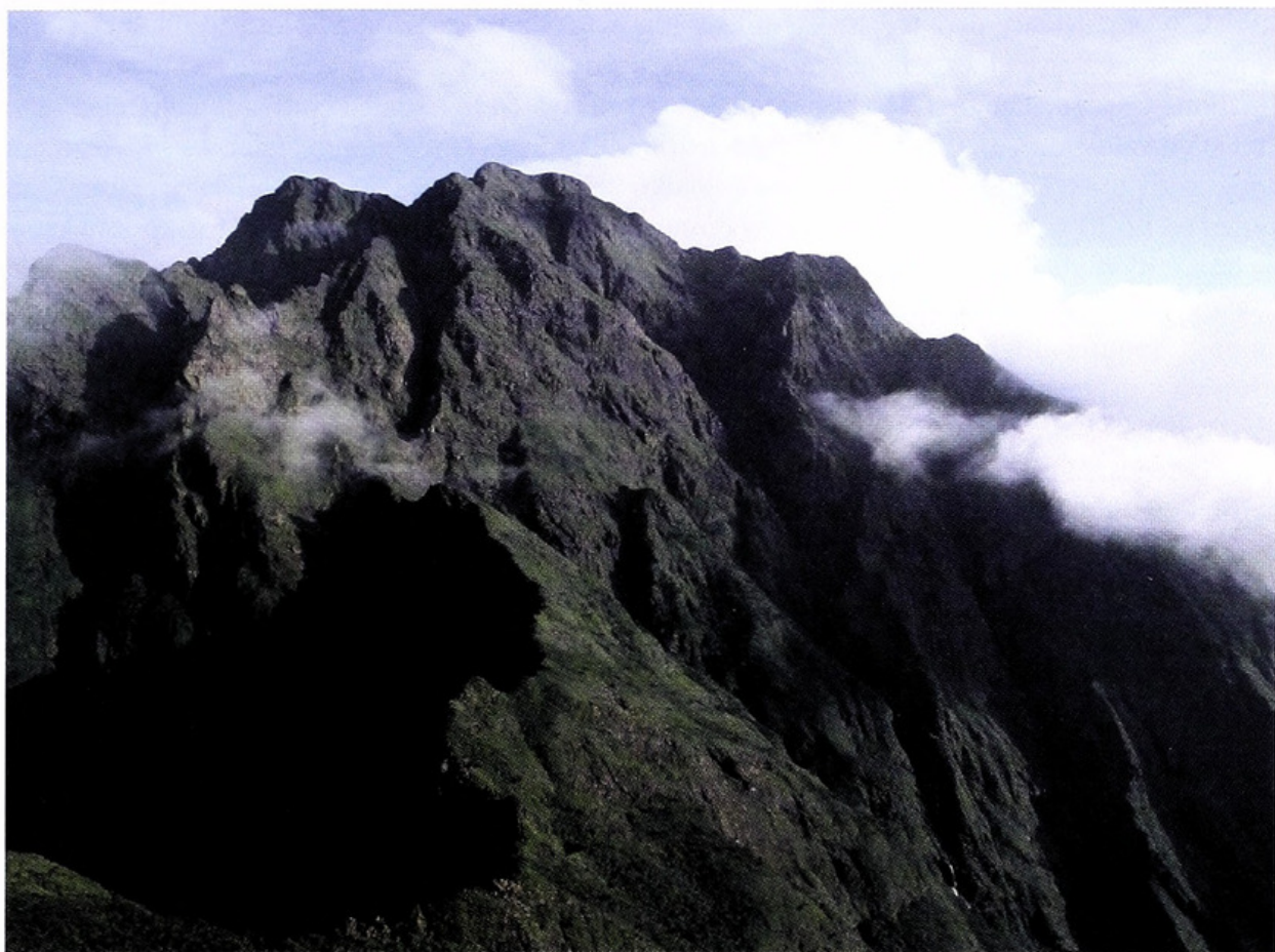
Figure 1: Guiting-Guiting looks rather rocky but there is quite dense vegetation on it; fogs and rains are very common features there.