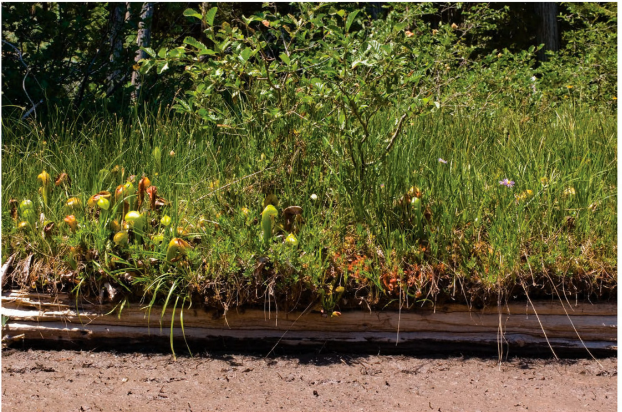
Figure 2: Can you see it? In the photo center, there is a single rounded head of Triantha occidentalis subsp. occidentalis in this Siskiyou County (California) Darlingtonia and Drosera rotundifolia lakeside habitat. There's also Utricularia macrorhiza and Utricularia minor present, but not visible in the photo.

In California, it flowers over a long season (depending upon altitude and exposure of the site), typically from July through September (Calflora 2021).