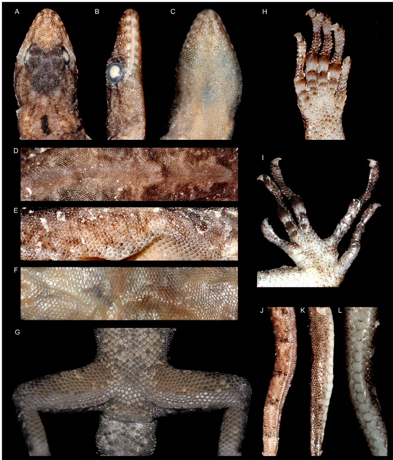
Fig. 2. Close-ups of Cnemaspis godagedarai sp. nov. male holotype (NMSL 2019.09.01.NH). (A) Dorsal head; (B) Lateral head; (C) Ventral head; (D) Homogeneous dorsal scales; (E) Scales on lateral surface of trunk; (F) Smooth ventral scales; (G) Cloacal characters with precloacal pores and femoral pores; (H) Subdigital lamellae on manus; (I) Subdigital lamellae on pes; (J) Dorsal scalation of tail; (K) Lateral side of tail; (L) Oval shaped subcaudals.

Diagnosis: Cnemaspis godagedarai sp. nov., can be readily distinguished from its Sri Lankan congeners by the following combination of morphological and meristic characteristics and color pattern: maximum SVL 35.5 mm; dorsum with homogeneous, smooth, granular scales; 2/2 supranasals; one internasal and 1/1 postnasal present; 26–28 interorbital scales present; 14–15 supraciliaries, 11–12 canthal scales, 24–26 eye to tympanum scales; three enlarged postmentals; postmentals bounded by 5–6 chin