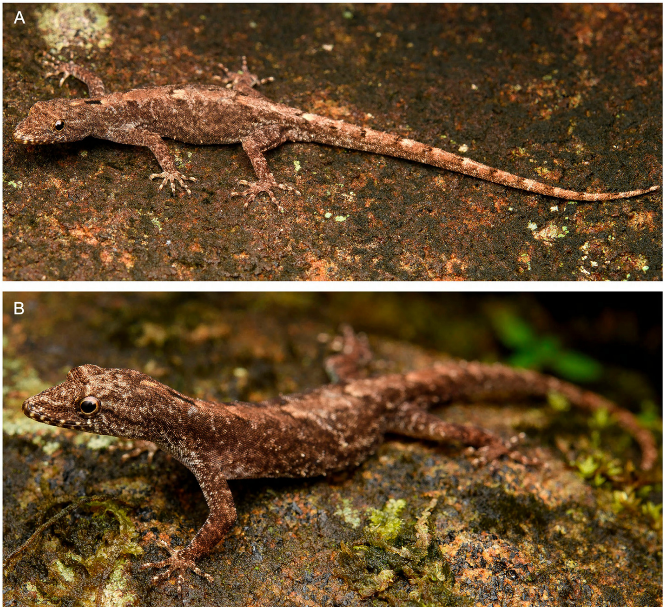
Fig. 3. Cnemaspis godagedarai sp. nov. male holotype (NMSL 2019.09.01.NH) in life in situ. (A) Dorsolateral view of the full body displaying color pattern. (B) Lateral view with temporal coloration.

supralabials; 7–8 infralabials; 17–18 subdigital lamellae on digit IV of manus, and 20–21 subdigital lamellae on digit IV of pes.