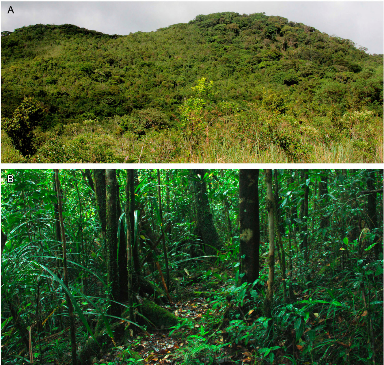
Fig. 4. General habitat of Cnemaspis godagedarai sp. nov. at Ensalwatte forest, Matara District, Sri Lanka. (A) Complete view of the forest hill. (B) Dense forest with cool and shady habitat.

short longitudinal black line on occipital area. Tail cinnamon brown dorsally, with 12 faded black cross-bands (Fig. 3); pupil is circular and black with surrounding yellow and light brown margins, supraciliaries being brownish; two postorbital stripes are present on each side, the upper white and the lower black; a light and dark interorbital stripe present; supralabials and infralabials brown and with dirty white spots; chin and gular scales light yellow, without dark spots; pectoral, abdominal, cloacal and subcaudal scales immaculate cream; long transverse black line on posterior thigh; dorsum of limbs with faded brown patches; manus and pes with black and cream white crossed stripe arrangement.