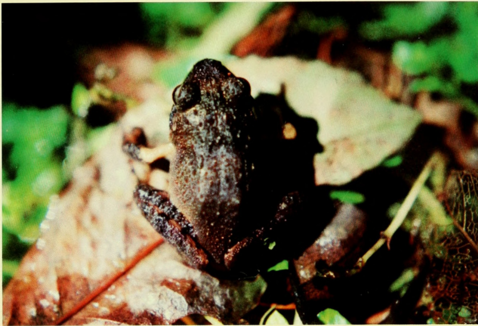
FIGURE 2. Platymantis naomii showing color pattern and dorsal skin ornamentation in life.