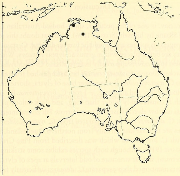
Fig. 3. Clivina demarzi spec. nov., distribution.

impressed, distinctly punctate to about last third. Intervals convex, especially at base and at apex, in holotype strongly convex throughout. A short scutellar stria present within 1st interval. Odd intervals near apex wider and more elevated than even intervals. 7th interval carinate, 8th interval extremely narrow near apex. In holotype three internal striae free at base, 4th stria meeting 5th; in paratype also 4th stria free. No subhumeral carina recognizable. Punctures on 3rd stria foveate. Structure of lateral channel slightly catenulate, because punctures are somewhat tuberculate. Microsculpture on elytra isodiametric, more distinct than on head and pronotum. Metasternum between intermediate and posterior leg shorter than metacoxa, in paratype much shorter. Metepisternum slightly (holotype) or considerably (paratype) wider than long, in paratype posteriorly rather wide. Last abdominal sternum 4-setose in both sexes. Posterior wings reduced to a small membrane. Elytra tightly fused together.