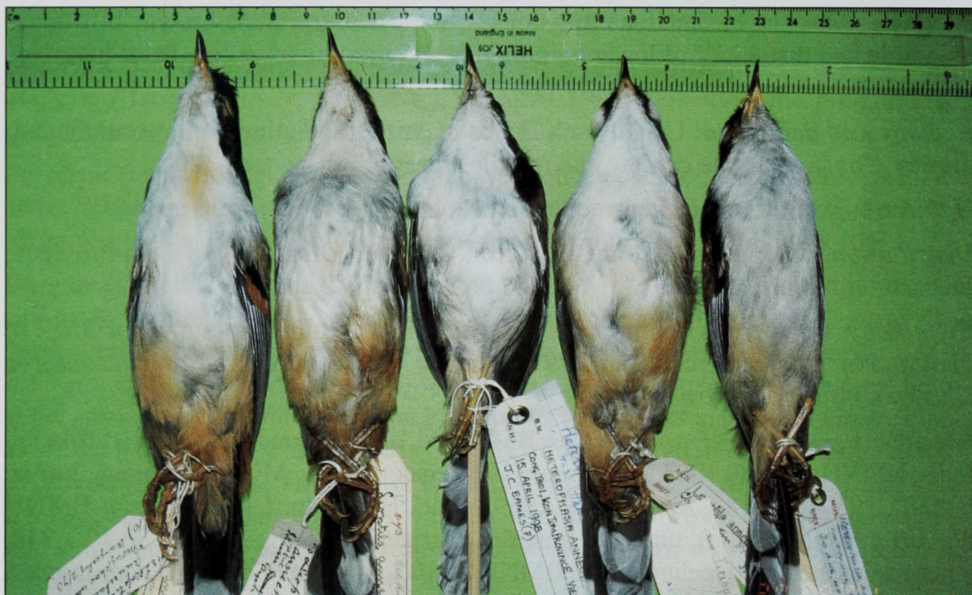
Figure 11. Ventral view of the holotype of Heterophasia annectans roundi (centre) together with (from left to right) H. a. annectans BMNH 86.10.1.748 (Topotype), BMNH 86.10.1.743, H. a. mixta BMNH 1930.7.16.390, H. a. saturata BMNH 1948.80.1899 (Topotype).