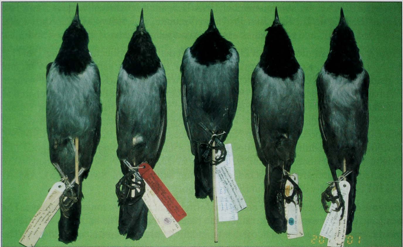
Figure 2. Ventral view of the holotype of Garrulax milleti sweeti (centre) together with four specimens of G. m. milleti (from left to right); BMNH 1919.12.20.268 (Paratype), BMNH 1919.12.20.266 (Holotype), BMNH 1919.12.20.527 (Topotype), and BMNH 1919.12.20.267 (Topotype).