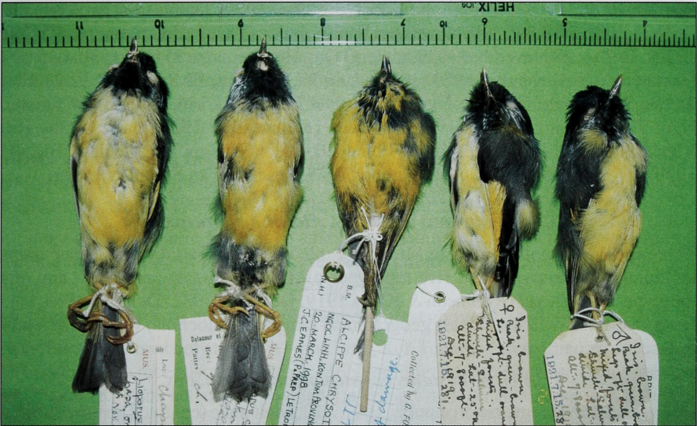
Figure 8. Ventral view of the holotype of Alcippe chrysotis robsoni (centre) together with (from left to right) A. c. amoena BMNH 1930.4.16.335 (Topotype) and BMNH 1930.7.16.336 (Topotype), and A. c. forresti BMNH 1921.7.15.281 (Topotype) and BMNH 1921.7.15.280 (Topotype).