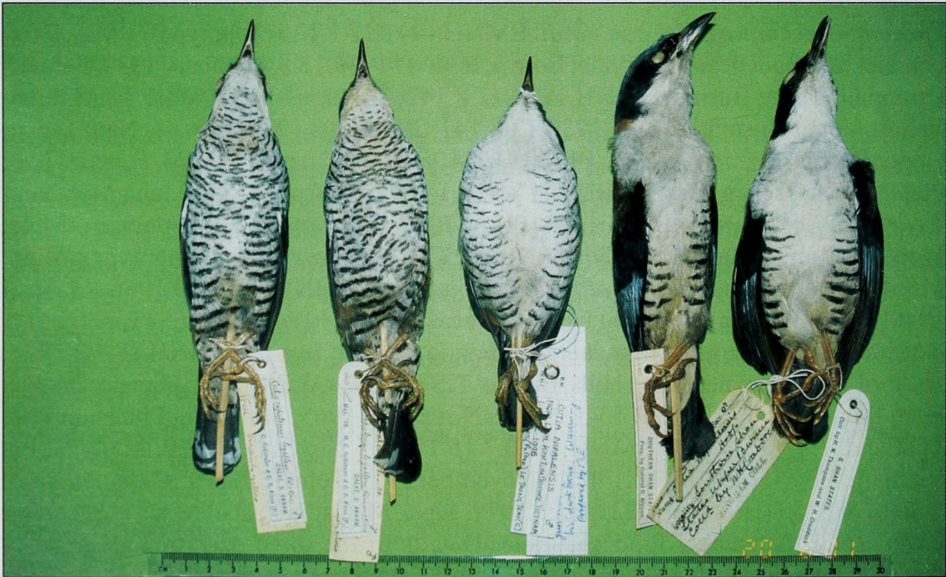
Figure 5. Ventral view of the holotype of Cutia nipalensis hoae (centre) together with (from left to right) C. n. legalleni BMNH 1919.12.20.333 (Paratype) and BMNH 1919.12.20.530 (Topotype), and C. n. melanchima BMNH 1900.12.20.430 and BMNH 1903.12.24.410.