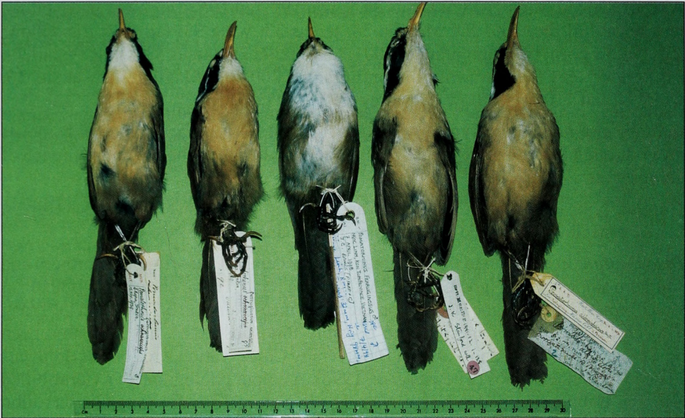
Figure 4. Ventral view of the holotype of Pomatorhinus ferruginosus dickinsoni (centre) together with (from left to right) P. f. orientalis BMNH 1930.7.16.175 and BMNH 1930.7.16.176, P. f. standfordi BMNH 1941.12.1.125 (Topotype) and P. f. albogularis BMNH 86.10.1.3570 (Topotype).