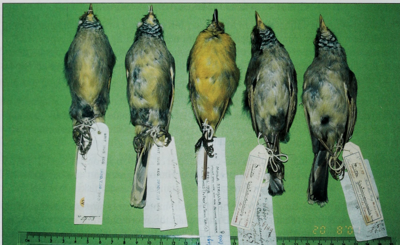
Figure 6. Ventral view of the holotype of Minla strigula traii (centre) together with (from left to right) M. s. yunnanensis BMNH 1930.7.16.303 and BMNH 1930.7.16.304, and M. s. castanicauda BMNH 86.10.1.6789 (Topotype) and BMNH 86.10.1.6788 (Topotype).