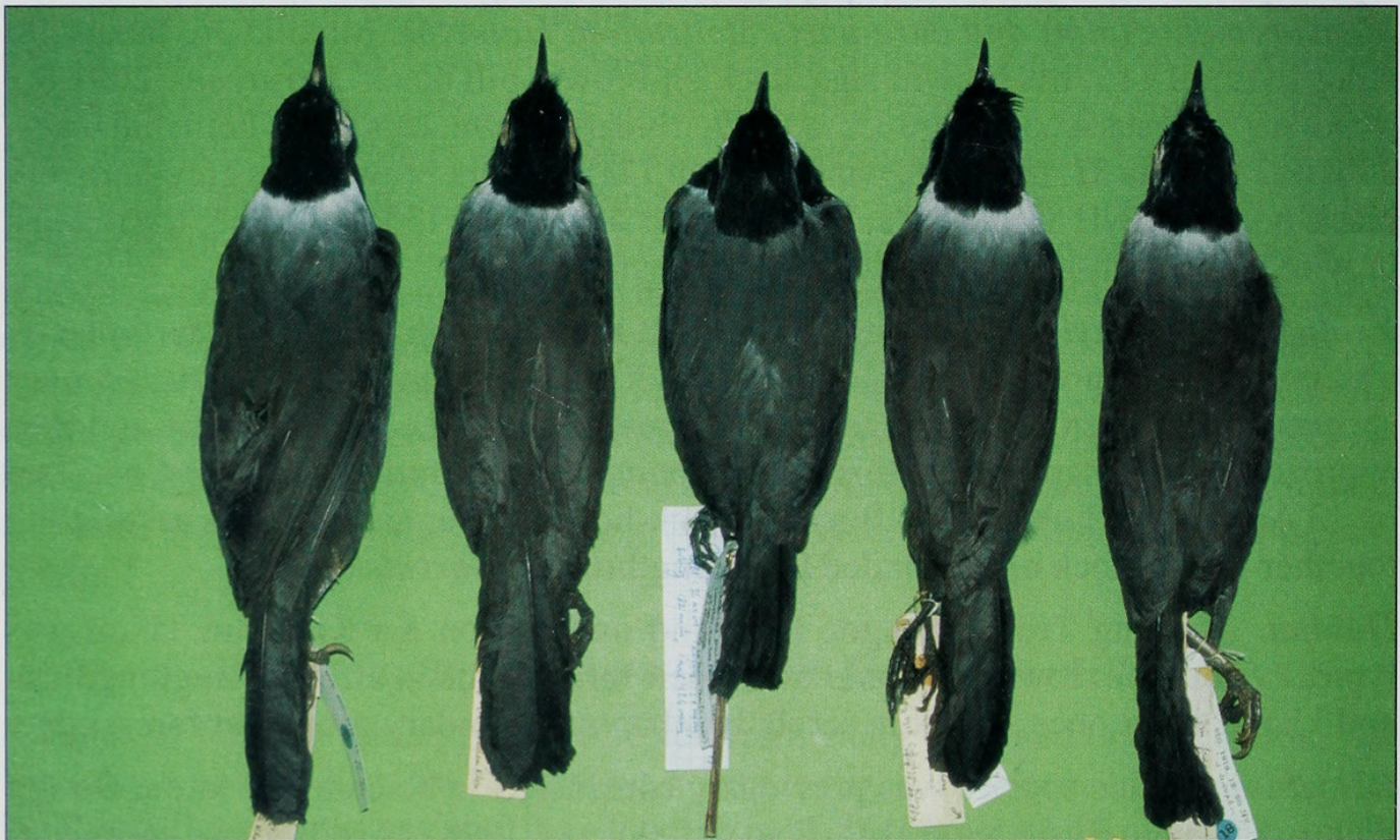
Figure 3. Dorsal view of the holotype of Garrulax milleti sweeti (centre) together with four specimens of G. m. milleti (from left to right); BMNH 1919.12.20.268 (Paratype), BMNH 1919.12.20.266 (Holotype), BMNH 1919.12.20.527 (Topotype), and BMNH 1919.12.20.267 (Topotype).