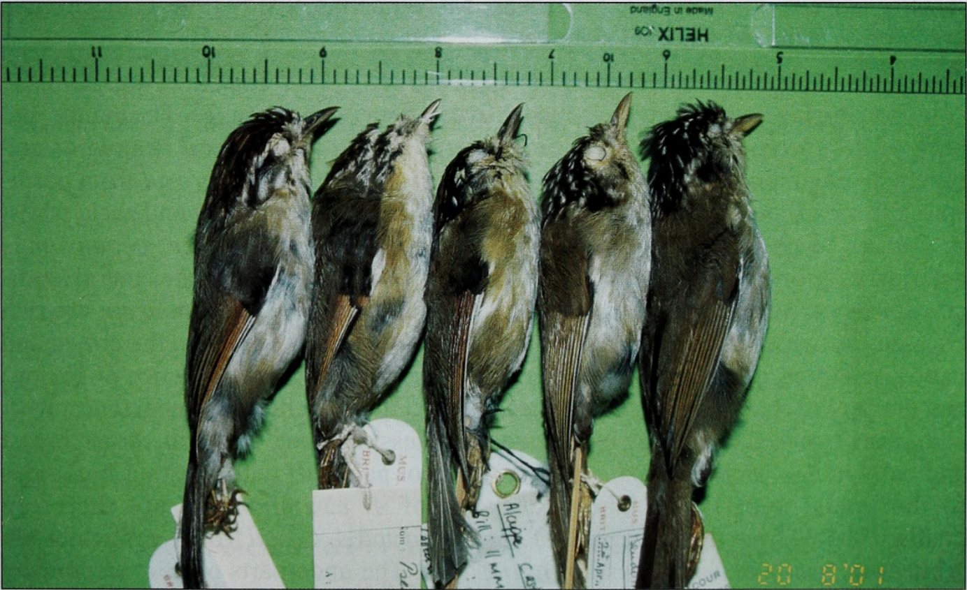
Figure 9. Profile view of the holotype of Alcippe castaneiceps stepanyani (centre) together with (from left to right) A. c. exul BMNH 1932.5.14.161 (Topotype) and BMNH 1930.9.16.328, and A. c. klossi BMNH 1919.12.20.301 (Paratype) and 1939.12.11.32 (Topotype).