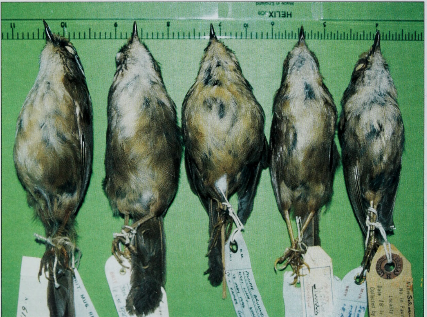
Figure 10. Ventral view of the holotype of Alcippe (brunnea) dubia cui (centre) together with (from left to right) A. d. genestieri BMNH 1930.7.16.208 and BMNH 1930.7.16.206, and A. d. intermedia BMNH 86.10.1.6282 and BMNH 1948.80.1686.