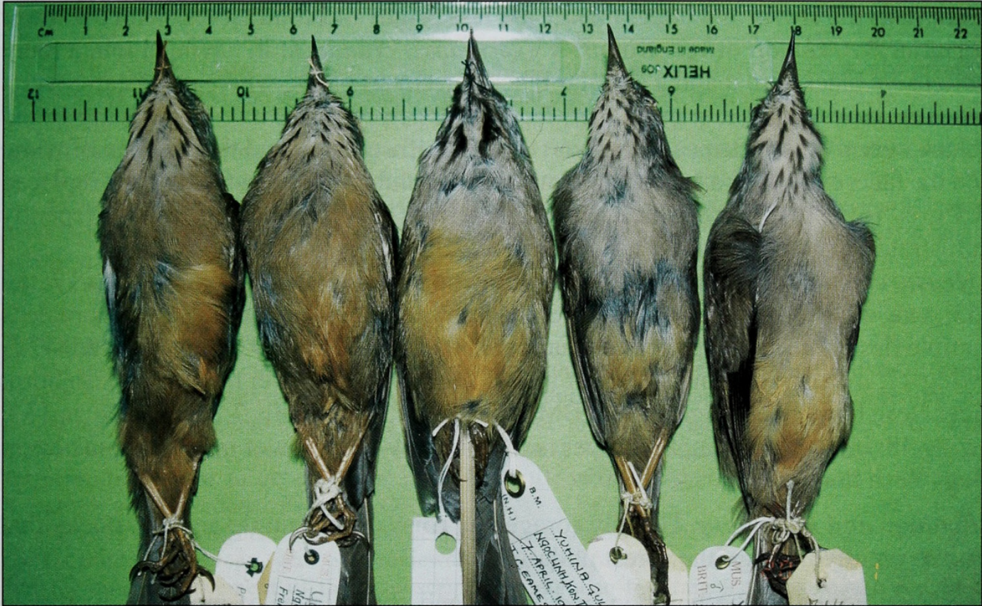
Figure 14. Ventral view of the holotype of Yuhina gularis uthaii (centre) together with (from left to right) Y. (sordidor) gularis BMNH 1924.12.21.160 and BMNH 1924.12.21.164, and Y. g. omeiensis BMNH 1922.12.7.258 and BMNH 1922.12.7.259.