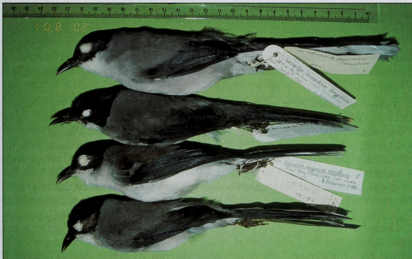
Figure 13. Profile view of the holotype of Heterophasia melanoleuca kingi (third from left) together with H. m. robinsoni BMNH 1939.12.11.45 (Topotype), H. m. engelbachi BMNH 1932.5.14.155 (Topotype) and H.m.tonkinensis BMNH 1930.7.16.395 (Topotype).

Diagnosis. H. m. kingii is generally intermediate between H. m. tonkinensis and H. m. engelbachi but shares some features with H. m. robinsoni . The grey wash on the breast in H. m. kingi is very similar to H. m. engelbachi and is almost undetectable in series, and less extensive than is shown by H. m. tonkinensis , in which it extends onto the sides of the breast and flanks, and H. m. robinsoni where it is confined to the