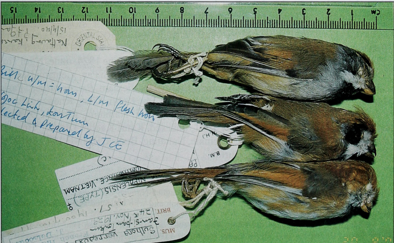
Figure 15. Profile view of the holotype of Paradoxornis nipalensis kamoli (centre) together with (from left to right) P. n. feae BMNH 1948.80.1978 and P. n. (verreauxi) craddocki BMNH 1930.7.16.299.