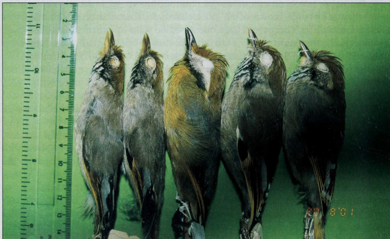
Figure 7. Profile view of the holotype of Minla strigula traii (centre) together with (from left to right) M. s. yunnanensis BMNH 1930.7.16.303 and BMNH 1930.7.16.304, and M. s. castanicauda BMNH 86.10.1.6789 (Topotype) and BMNH 86.10.1.6788 (Topotype).