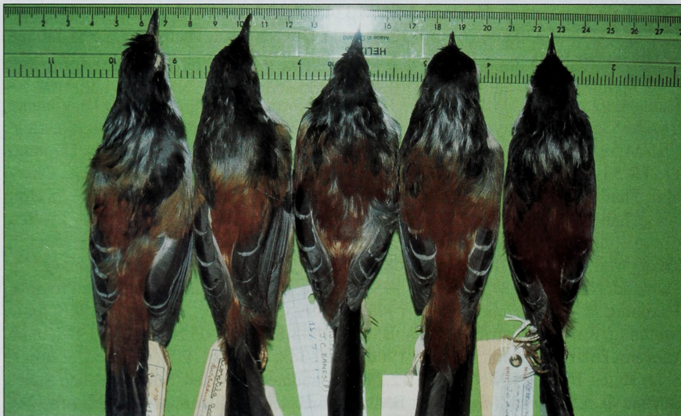
Figure 12. Dorsal view of the holotype of Heterophasia annectans roundi (centre) together with (from left to right) H. a. annectans BMNH 86.10.1.748 (Topotype), BMNH 86.10.1.743, H. a. mixta BMNH 1930.7.16.390, H. a. saturata BMNH 1948.80.1899 (Topotype).