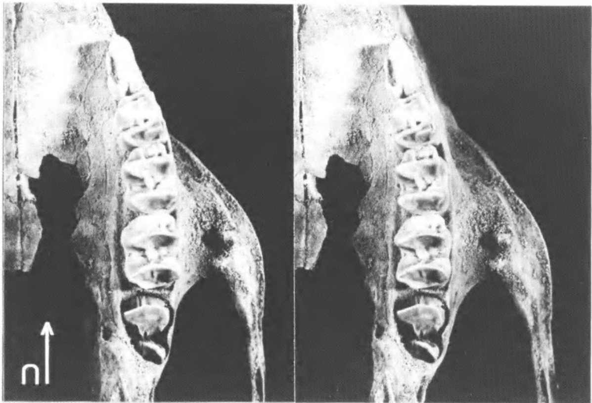
FIGURE 2. Congruus congruus holotype P33475, stereopair of left cheek teeth, x 1.5.

which opens near the posterior edge of the labial surface so that the small lingual crest is barely visible and the groove so formed is barely visible on the labial surface. I have interpreted a pit, midway along the posterolabial edge of this tooth, as pathological but of localised effect and not associated with any general distortion of the crown – a view supported by the alveolus of the right I^3 which indicates a very similar tooth. It is probable that all the incisors were high crowned, and that, their relative sizes were I^1 > I^2 > I^3 . Their combined outline in occlusal view was probably U-shaped.