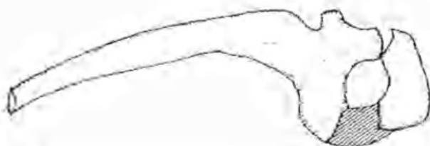
Fig. 1 Lateral view of the pelvis of Uperoleia micromeles (Paratype).

with each other on their proximomedial border, with large transversely elongated O. centrale postaxiale distally. O. radiale articulates laterally with O. centrale preaxiale.