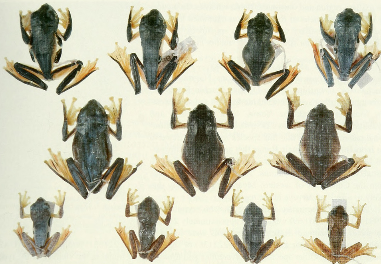
FIGURE 3. Dorsal view of representative specimens of Rhacophorus htunwini sp. nov. (top row), representative specimens of female R. bipunctatus (middle row), and representative specimens of male R. bipunctatus (bottom row).

the R. malabaricus species group ( R. calcadensis and R. malabaricus ), R. lateralis , R. pseudomalabaricus , and R. turpes by axillary spots.