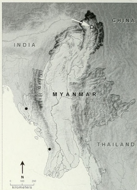
FIGURE 4. Distribution of Rhacophorus htunwini sp. nov. in Myanmar with type locality indicated by a star (at tip of arrow).

The type specimens including the holotype (CAS 229913, USNM 561869) were found approximately 2 m off the ground in bamboo. Referred specimens were found in undisturbed habitat near a spring (CAS 222136) or seasonal (CAS 221351) and permanent (CAS 222065) streams. Other species of Polypedates and Rhacophorus found in the vicinity of the type locality were P. leucomystax , R. bipunctatus , and R. dennysi .