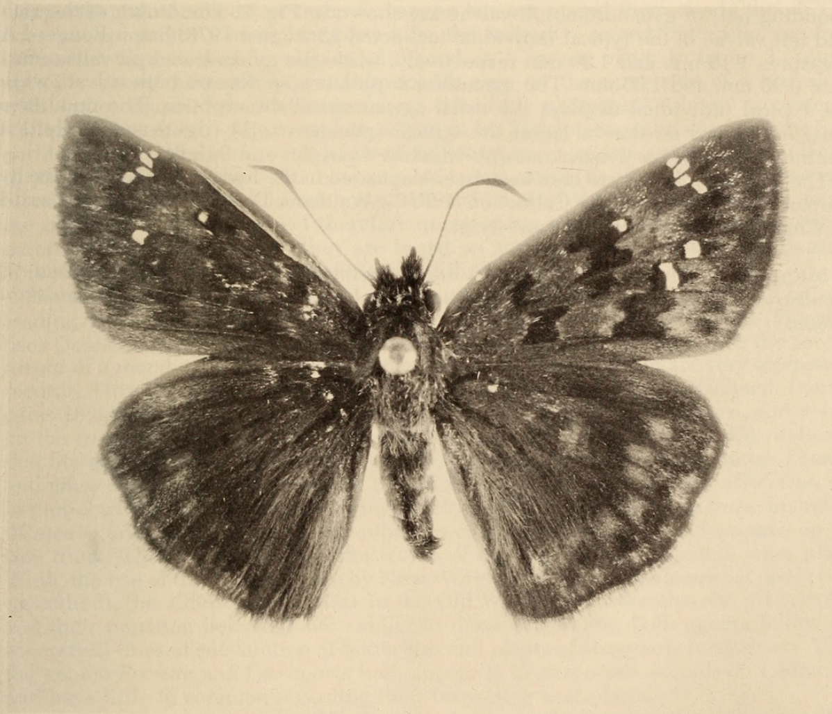
FIG. 1. Bilateral gynandromorph of Erynnis horatius Scudder and Burgess.

The external genitalia were dissected and consisted of male structures including an aedeagus. A bursa copulatrix was also present. The valvae of a typical individual (com-