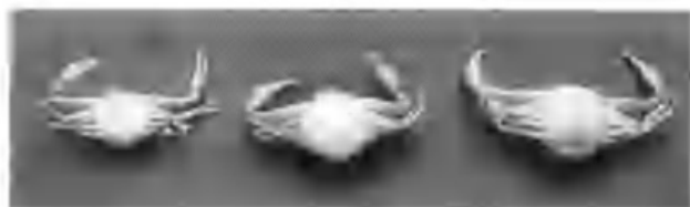
Fig. 1. Abdominal morphology of Phillyra laevis . From left to right: male, intermediate (= juvenile female) and adult female.

1982). This was the case for all Phillyra laevis with carapaces wider than 13.5 mm, but three morphological types were found in crabs 13.5 mm wide or smaller: the two previously described forms, plus individuals with a convex sided abdomen which, at its widest point, was approximately half the width of the carapace (Fig. 1). The last described individuals were named "intermediates".