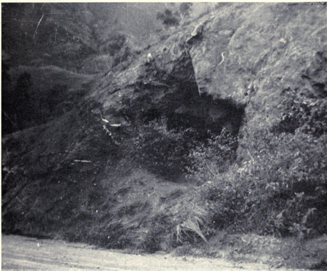
FIG. 83. Cave made by coal-mining, Mount d'Or, New Caledonia, night-time resting site for Miniopterus a. australis and M. macrocneme .

Numbers found on New Caledonia were even smaller in comparison to the numbers found at Hog Harbour, Espiritu Santo, New Hebrides, where Baker and Bird estimated as many as 5,000 (mostly M. australis ) in one cave. The cave at Bouloupari never contained more than 400 or 500 bats. The largest number observed at Paita