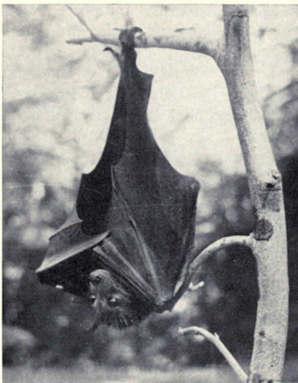
FIG. 79. Normal resting position of Pteropus ornatus , New Caledonia.

Measurements (5 adult males, 3 adult females).—Forearm 153–167.8. Skull: greatest length 70–72.8; condylo-basal length 67–69.5; palatal length 34.9–36.6; interorbital width 8.6–9.6; intertemporal width 6.2–8; zygomatic width 34.4–37.6; mastoid width 20.8–21.9; width of brain case 22.5–23.7; upper toothrow 25.3–27.3; width