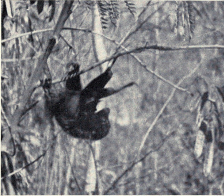
FIG. 81. Pteropus ornatus , showing method of moving around in trees, New Caledonia.

no indication of abandonment. In another case two Frenchmen, MM. Henri Berlioz and Auguste Le Bouhelke, knew of one big camp, which they visited every year previous to the war. When American troops were sent to New Caledonia, a division training area was established on and surrounding the site of this particular camp. If flying foxes occupied the camp during this period they