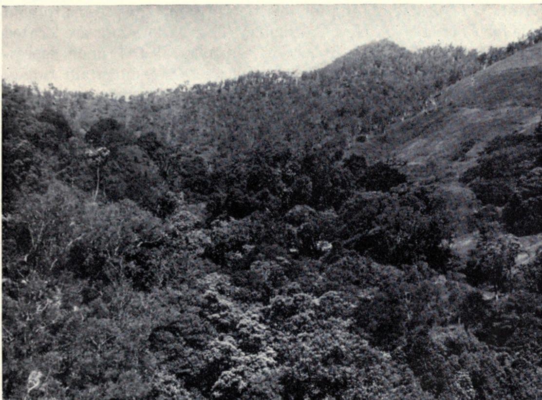
FIG. 80. Rain-forest-like timber in center foreground, open niaouli woods in left background. Such areas are often chosen for camp sites by Pteropus . Dumbea Pass, New Caledonia.

numbers. The account pertains primarily to ornatus . When the camp was first visited on October 23 (spring season), between 15 and 25 flying foxes were present. On October 29, only one animal was found. On January 19, only two animals were present; but by March 31 (fall season), approximately 50 animals were occupying