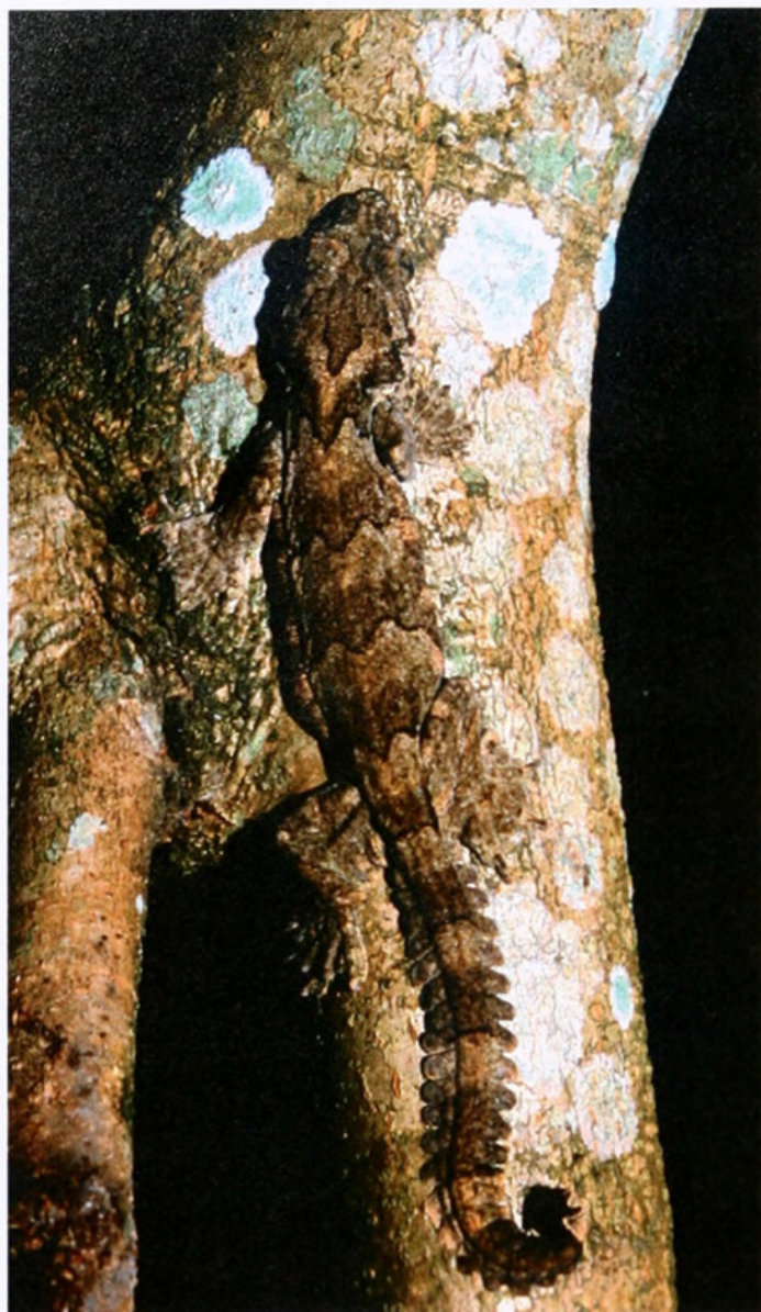
Figure 2. Ptychozoon lionotum (Adult female, BNHM 1445) from Mizoram, northeast India.

On 6th April 1999, SP, along with his field assistant, spotted the second Ptychozoon at 1820 hrs, next to a dirt track in a patch of mature evergreen forest south of NWLS boundary, ~40 km (straight-line) south of the first locality. NWLS is the only remaining patch of unfragmented, mature primary forest in the area, characterized by a three-tiered structure, with towering, buttressed, deciduous emergents up to 50–60m in height, followed by middle and tertiary canopy trees (Pawar, 1999). This area, especially the Ngengpui valley, experiences five rainless months, but the effective dry period is much shorter, with humidity being consistently high during these months due to fine, localized precipitation from cloud and fog. This individual was smaller than the first one and was spotted at a height of 5 m on the trunk of a Sterculia scaphigera tree. The tree is characterized by a deeply fluted trunk and a smooth but slightly flaking bark, and occurs as a deciduous canopy-emergent in pri-