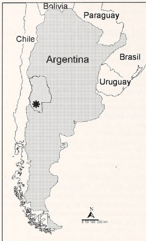
Figure 1. Map of Argentina (sparse dots). The asterisk indicates the studied area, Sierras del Palauco, in the Province of Mendoza (dense dots).

containing water and vegetation from the collecting site.